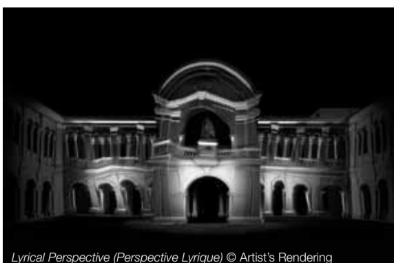
Lyrical Perspective (Perspective Lyrique) © Artist's Rendering