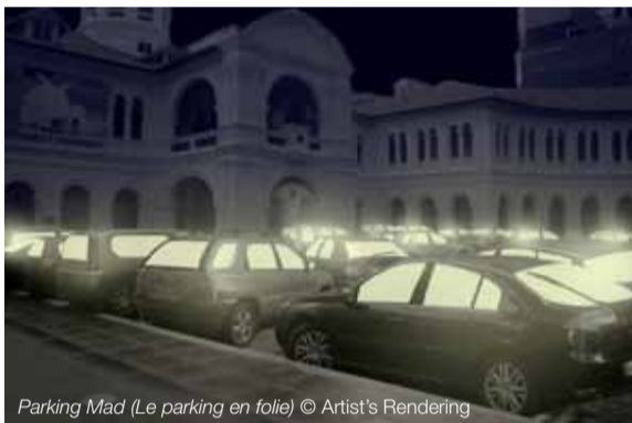
Parking Mad (Le parking en folie)

Fri, 26 Aug – Sat, 3 Sep | 7:30pm – 2am | Queen Street Wing, SAM