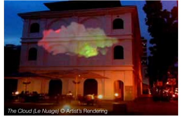
The Cloud (Le Nuage) © Artist's Rendering

Fri & Sat, 26 & 27 Aug and 2 & 3 Sep | 7:30pm – 2am | Courtyard, SAM