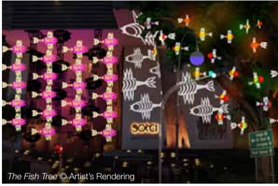
The Fish Tree © Artist's Rendering