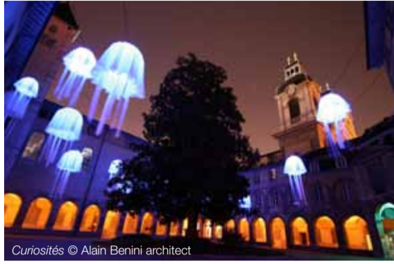
Curiosités © Alain Benini architect

Fri, 26 Aug – Sat, 3 Sep | 7:30pm – 2am | SOTA Façade