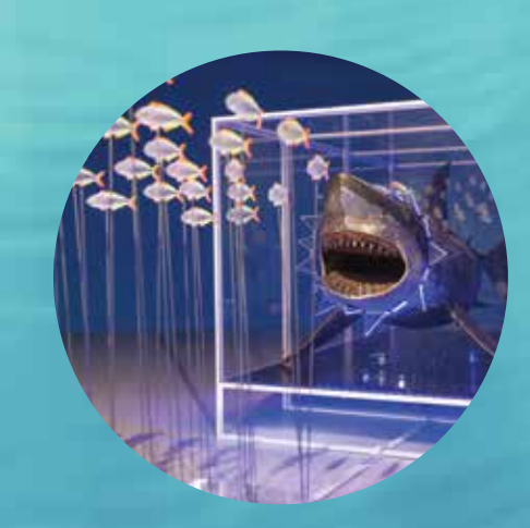
Surrealism Spiced (After Salvador Dali)