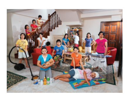
Singapore Idols - Aunties & Uncles