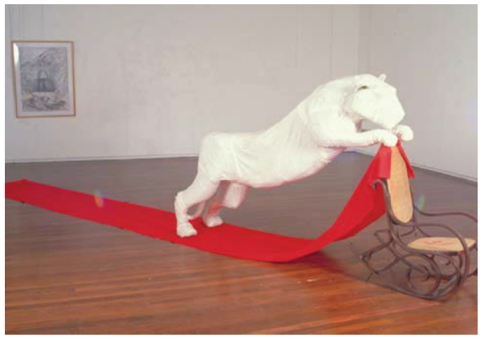
Tang Da Wu, Tiger's Whip, 1991, Mixed media installation, Dimension variable, Collection of Singapore Art Museum

An example of an artwork that is part performance and part installation is Tiger's Whip by the Singaporean artist Tang Da Wu. This artwork comments on the exploitation of tigers for the supposed aphrodisiac powers of their reproductive organs. During the performance, the artist dragged behind him one of ten lifesized papier-mâché tigers. In the installation art component shown below, a tiger standing with front paws rests on a rocking chair that has been painted red and draped in a red cloth. This represents the tiger's vengeful spirit returning to haunt its poacher.