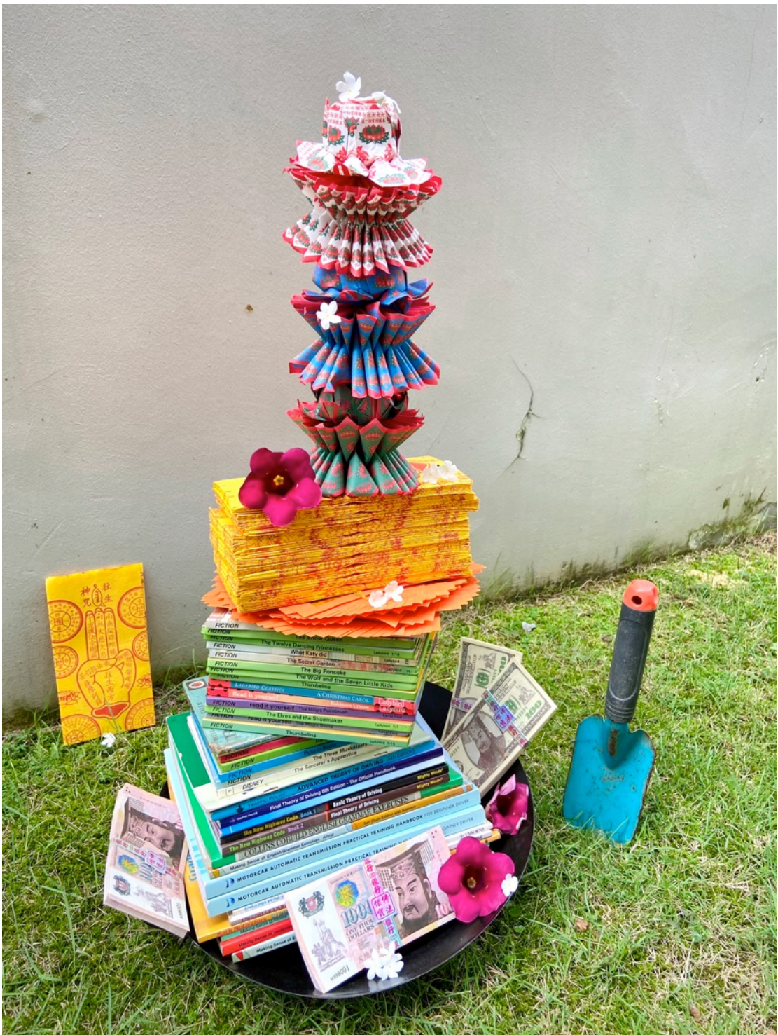
Wok, English textbooks, English storybooks, driving textbooks, Hokkien gold paper money, reincarnation paper, paper bills, Allamanda, water jasmine, spade.

The idea is that the ancestors are perceived as being present among the family, and they are therefore often invited to participate in the various activities of the living. <sup>CDRS</sup>