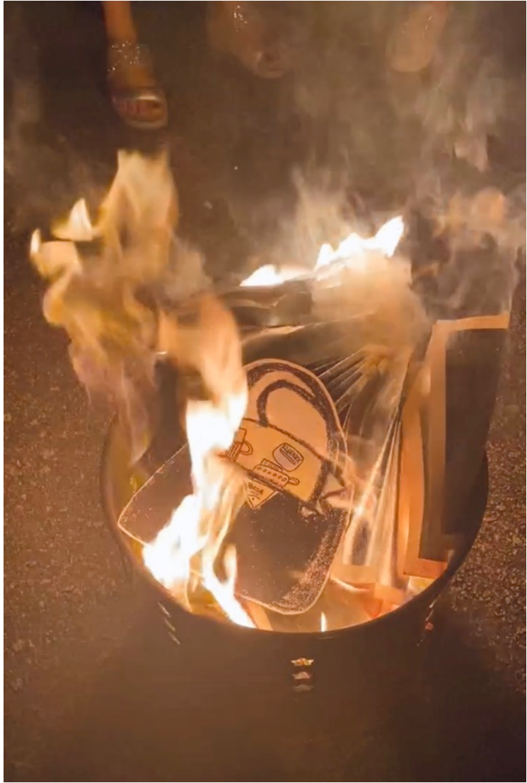
Prada handbag with tissue paper, wallet and foldable umbrella inside

With the invention of paper in the early Han dynasty, paper images were substituted and offered in token sacrifice by burning, in the belief that through the alchemy of fire they would find their way into the Otherworld to be used by the spirit in his new existence. <sup>CAWM</sup>