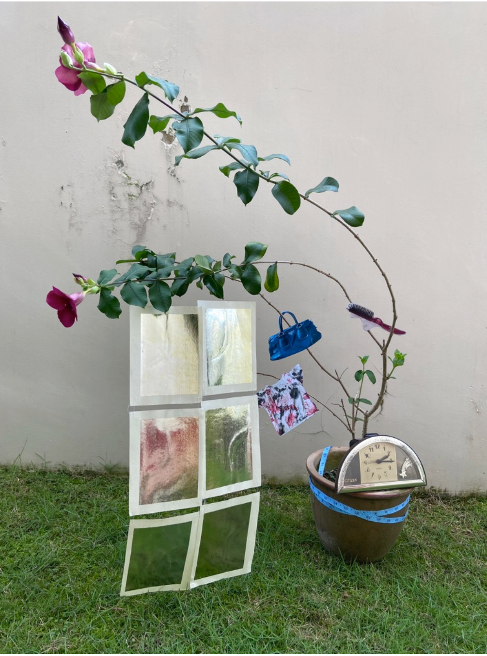
Allamanda, paper money, paper effigies, clock, measuring tape.

vii. TENSES, or can you understand the time of a flower