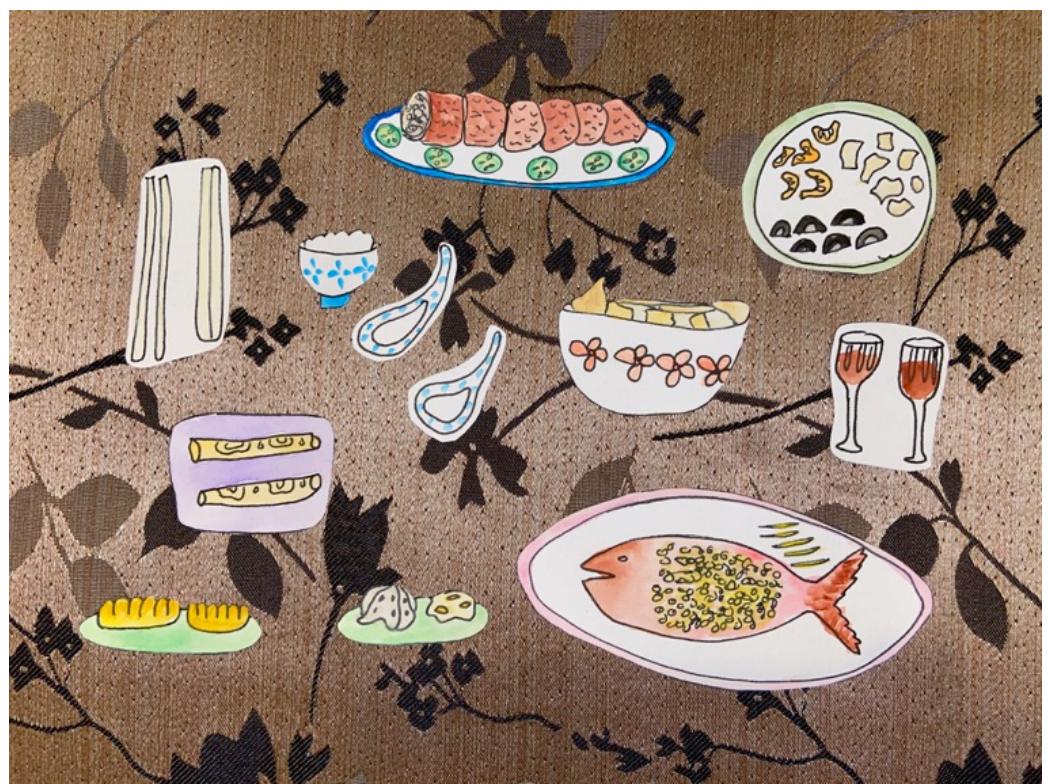
Homemade Chinese New Year reunion dinner paper gift set

The institution of ancestor worship (from the point of view of its ideological underpinnings) is essentially Confucian. Yet the belief in the existence of the spirit world goes back to early Chinese animism but later given systematization by Taoism, Confucianism, and Mahayana Buddhism...Ancestor worship may be said to be central to Chinese life in general because it serves as a link between the world of the living and the world of the dead...It is in the institution of ancestor worship that one sees more strikingly the meshing of folk, Confucian and Taoist ideas and beliefs.