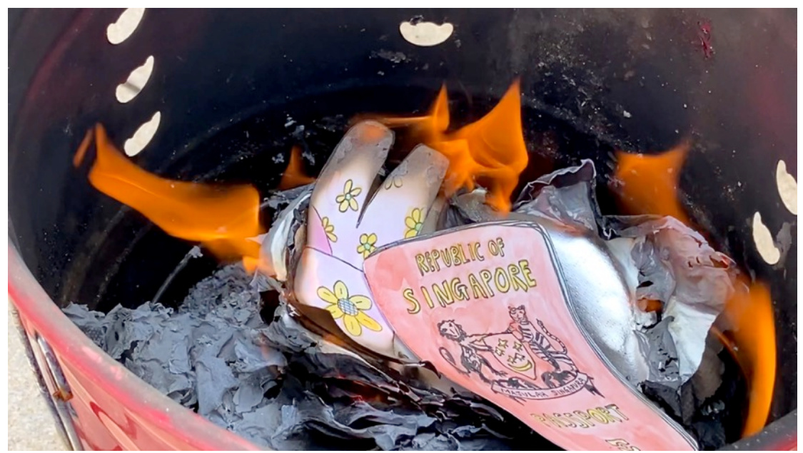
Homemade pajamas and passport paper gifts

YIPO: Lih ai buay zua eh wei tua hor yih, yih jin ai ceng swee eh wei tua. Ah lih wu buay passport hor yih boh? Yih jin ai chood kok. You must buy paper sandals for her, she loves pretty sandles. Did you buy passport for her or not? She loves travelling.