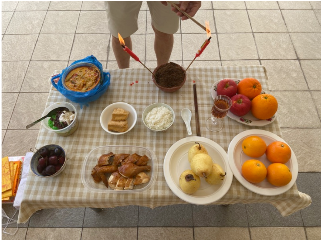
49<sup>th</sup> day prayer

On the forty-ninth day, a special ritual known as gong de is performed...The performance of the gong de ritual is important as it represents the final conversion of the deceased into an ancestral spirit...The offering of vast quantities of gifts and money seeks to transform the deceased into a wealthy ancestor who is obligated to reciprocate with return gifts. Kuah (Rebuilding the Ancestral Village: Singaporeans in China, 2000) notes that the gong de ritual has to do with installing the deceased as a bona fide ancestor in the genealogy. It is related to Buddhist ideas that the transfer of merit can make up for the bad karma of the deceased and provide the dead with the energy to move up in the underworld to other planes of existence: gong de is thus also a rite of redemption whereby the wrongdoing of the dead can be redeemed through the efforts of the living, so that the dead eventually become ancestors.