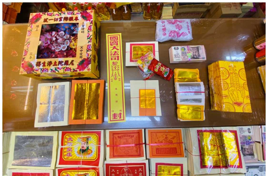
An array of joss paper at Ban Kah Hiang Trading. Different dialect groups use different gold and silver paper money designs. Top left: folded lotus flowers with reincarnation sutras. Yellow rectangular paper on right: 往生钱, reincarnation money (literally, towards birth money).

In the last years of your life, you would say, "我死了谁会烧给我?我跟你讲, 以后我死了,放在公明山,什么都不必烧!简单就好!" (When I die who will burn things for me? I tell you, my remains will be at KMS, no need to burn me anything! Keep it simple!) But I would insist. This insistence came through sobs when you were very ill. "我会永远烧给你的," (I will burn you paper offerings forever). I wailed. <>