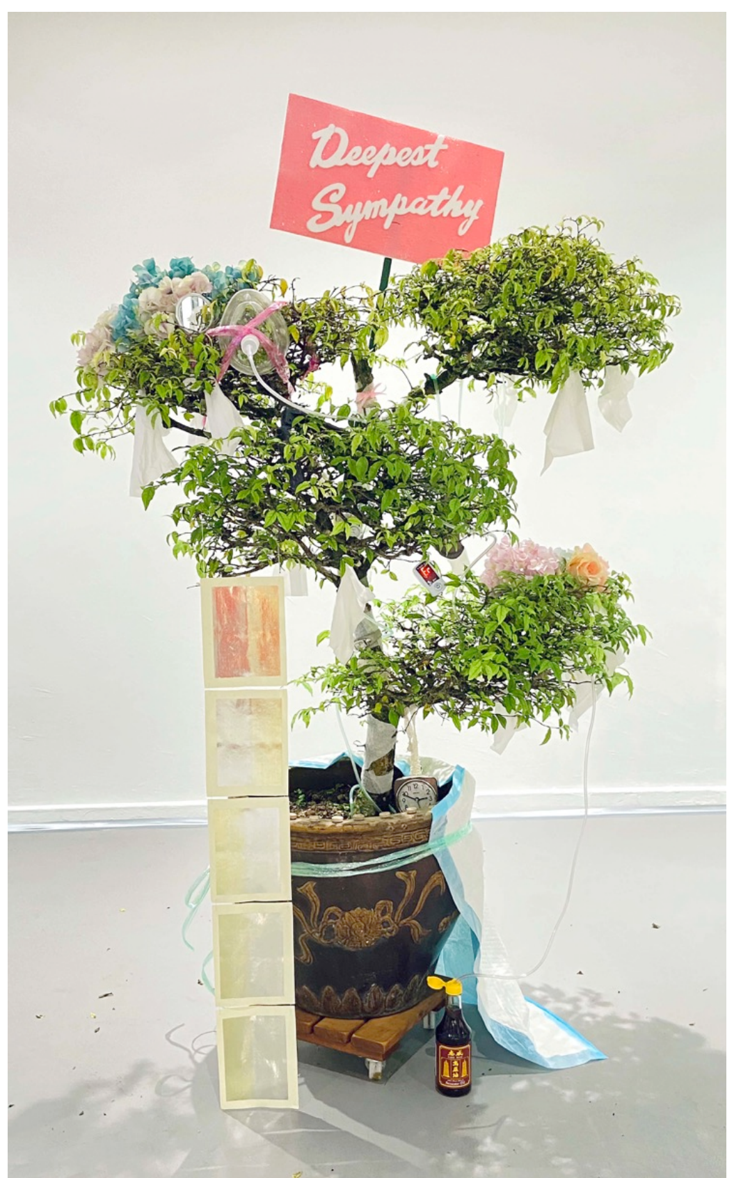
Mama Don't Die - water jasmine bonsai, personal effects, medical equipment, paper money.