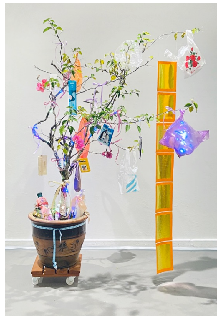
Mama Xmas Tree - bougainvillea plant, personal effects, paper money.

Last week I dreamt that I was burning paper money but I can't remember for whom. I just can't recall.