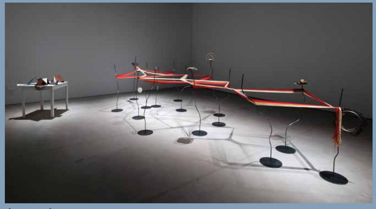
ÁHCAGASTÁ – TALES OF THE EMBER