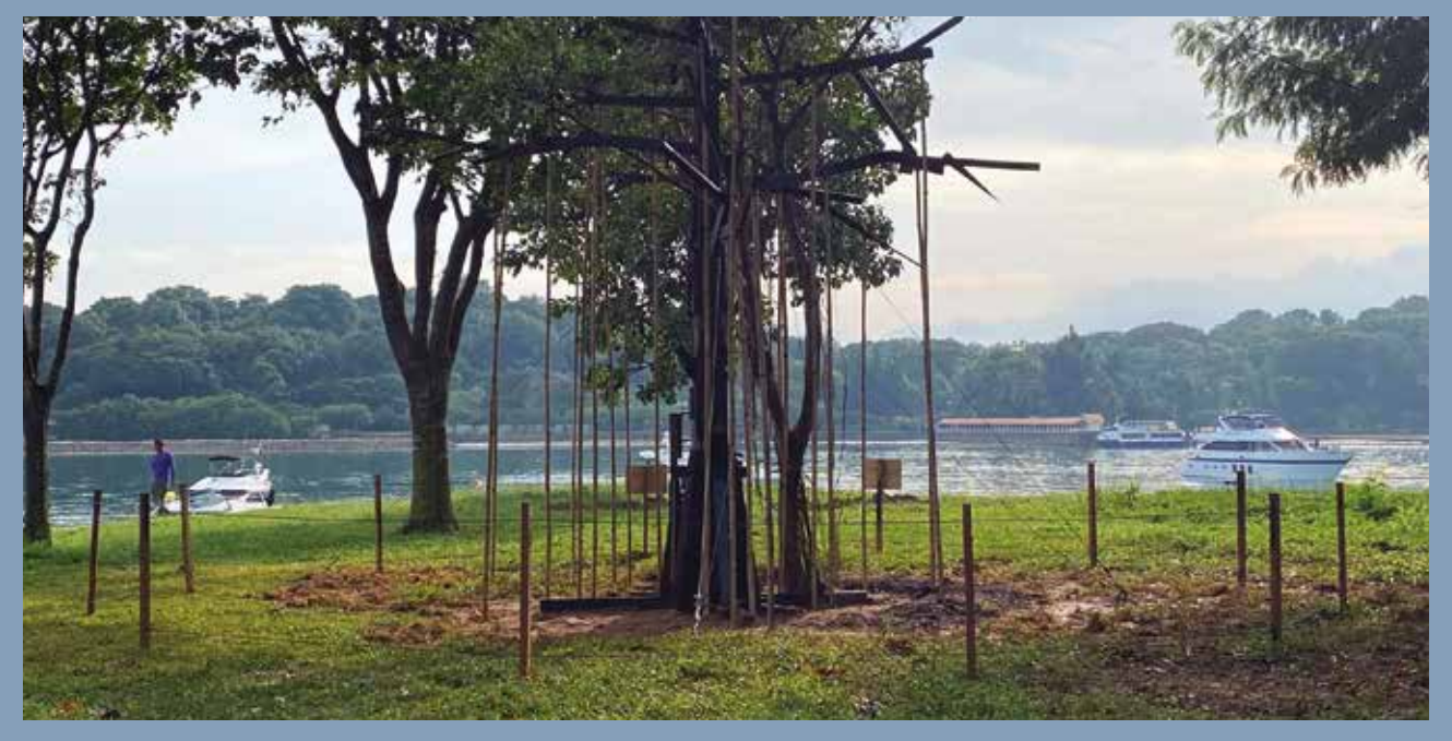
KANCIL MENGADAP BERINGIN