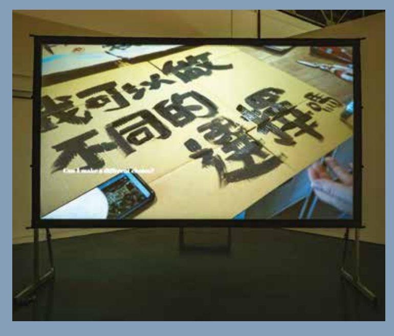
《旗津本事: 旗津的帝國滋味》 CIJIN PÚN-SŪ: CIJIN'S TASTE OF EMPIRES 2022

Video, single channel, sound, 18 min Singapore Biennale 2022 Commission