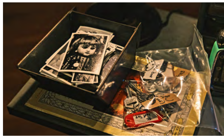
Installation view of Donna Ong's The Caretaker; Image courtesy of Singapore Art Museum