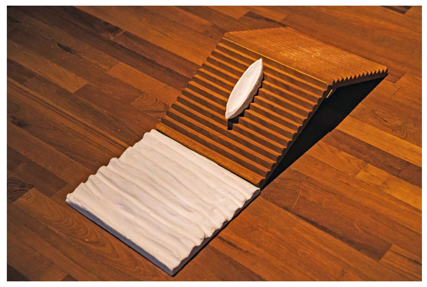
Installation view of Tang Da Wu's Monument for Seub Nakhasathien