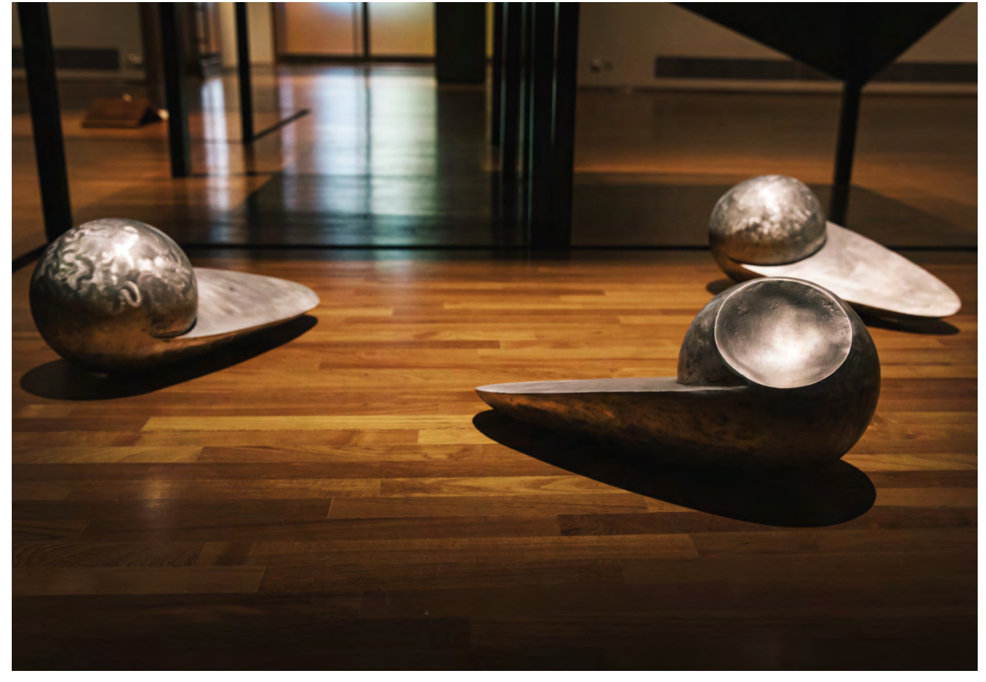
Installation view of Anthony Lau's Space Eggs