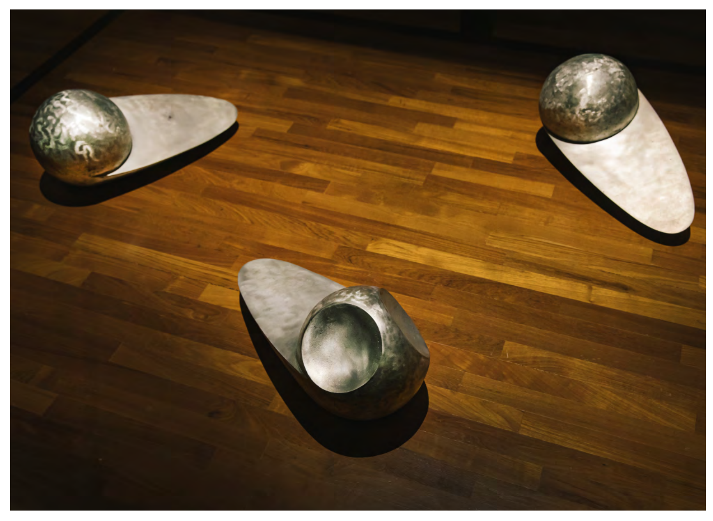
Installation view of Anthony Lau's Space Eggs