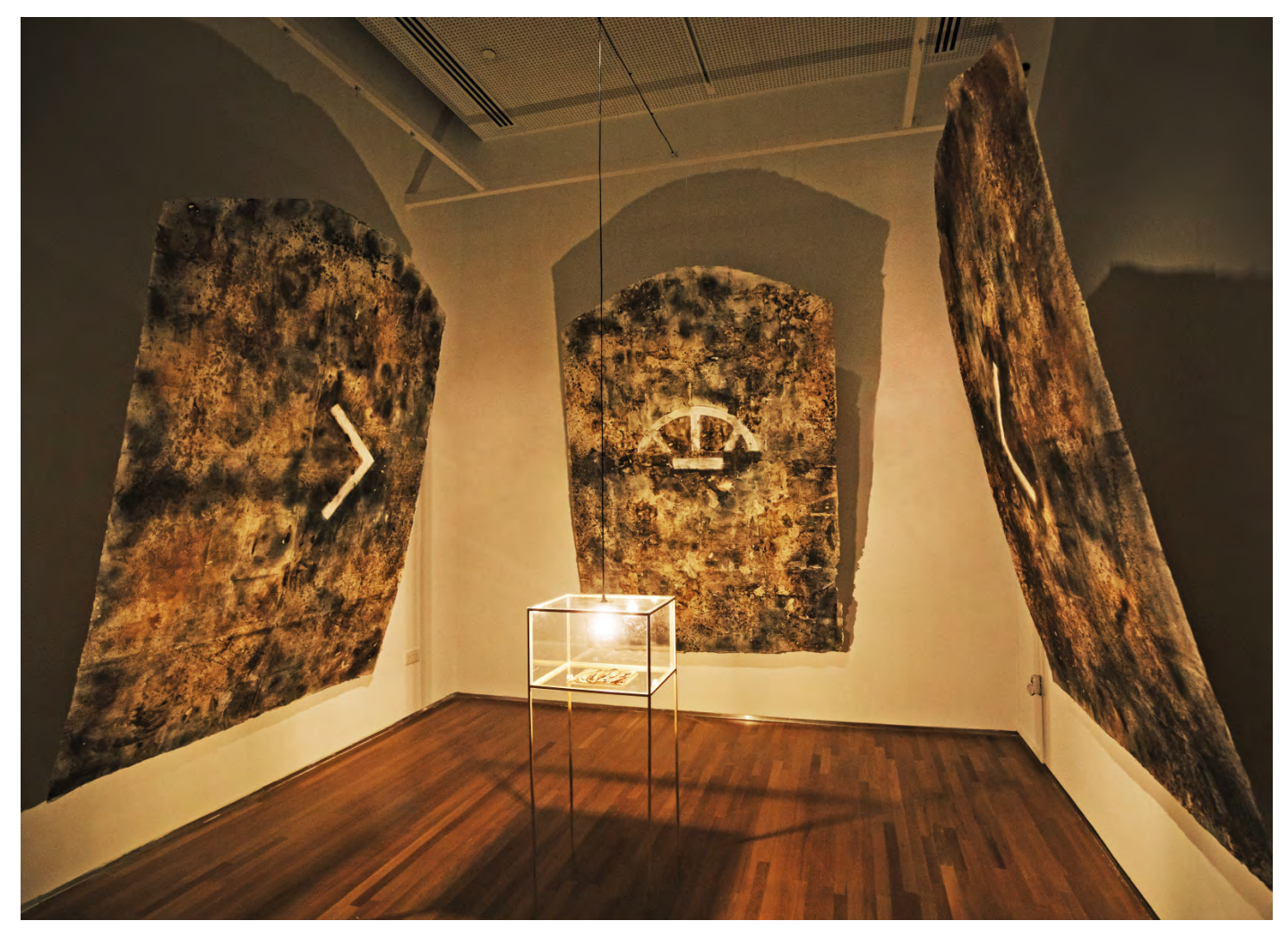
Installation view of Salleh Japar's Born out of Fire; Image courtesy of Singapore Art Museum