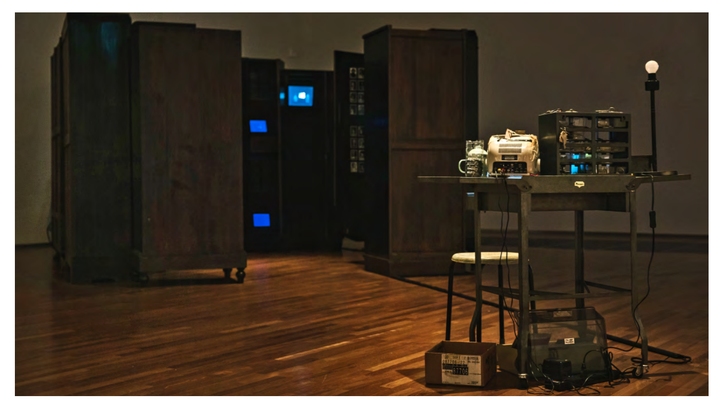
Installation view of Donna Ong's The Caretaker