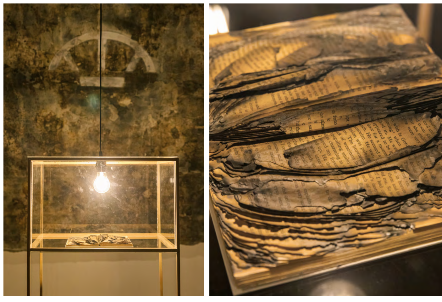
Installation view of Salleh Japar's Born out of Fire