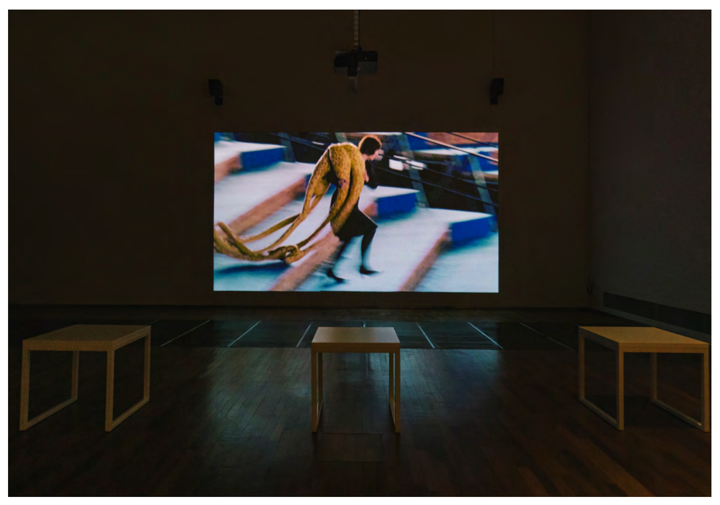
Installation view of Holly Zausner's Second Breath