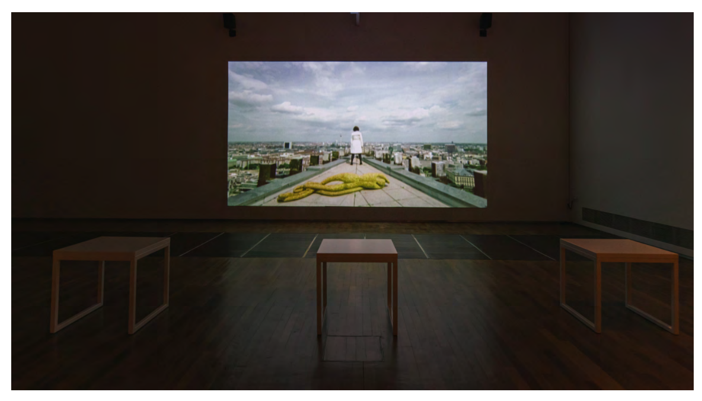
Installation view of Holly Zausner's Second Breath