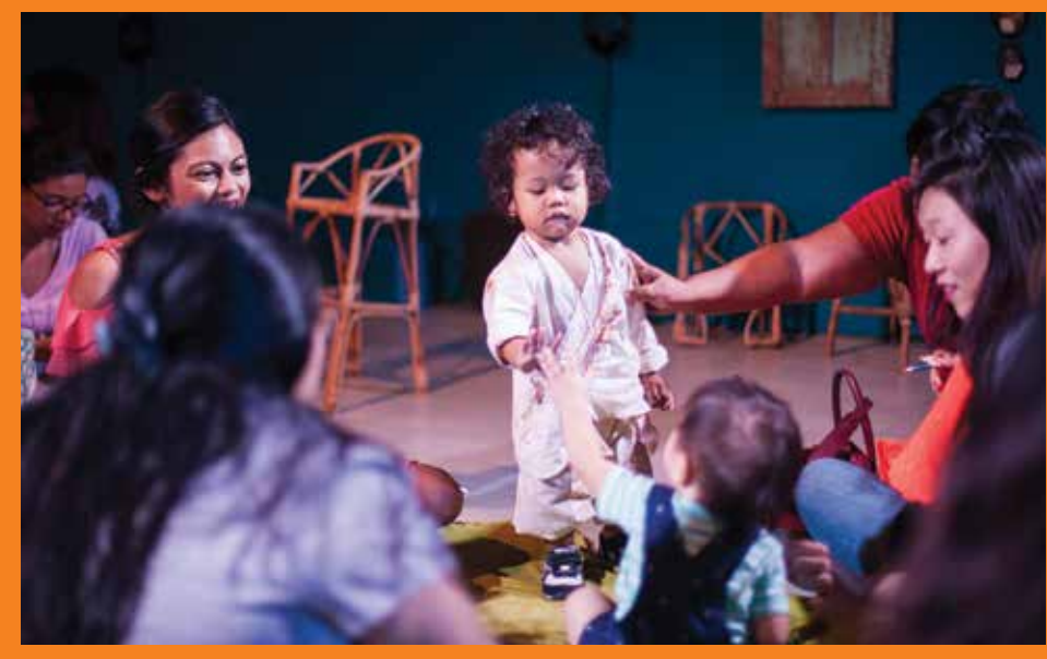
ndonesia's Papermoon Puppet Theatre performing Prani: the breath at SAM at 8Q, as part of Imaginarium: Over the Ocean, Under the Sea in 2016

The current trends in contemporary art have gravitated towards Asia, making this an exciting and opportune time for organisations and individuals to forge long-term funding partnerships with the Singapore Art Museum (SAM). As a partner, your contribution will go towards supporting exhibitions, as well as education and community engagement programmes.