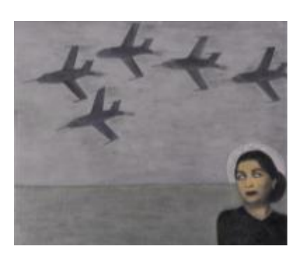
Huda Lutfi Democracy is Coming 2008 Acrylic and collage on paper 37 x 45 cm Barjeel Art Foundation Collection

Trained as a cultural historian, Huda Lutfi mines Cairo's markets, antique shops and the urban environment for images and objects that draw on Egypt's rich cultural heritage. Re-contextualising and subverting this imagery in collages, paintings and installations, Lutfi utilises bricolage as strategy to create works that are both playful and politically poignant. Frequently incorporating text from Sufi and medieval Arabic poetry into her work, Lutfi interweaves historical narratives and icons to comment on contemporary issues, often related to gender politics.