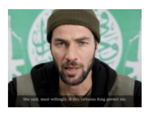
Sharif Waked To Be Continued... 2009 Single Channel Digital Video 41 min 33 sec Edition 5/5 Barjeel Art Foundation Collection

Through painting, video and installation, interdisciplinary artist Sharif Waked explores contemporary politics. Compelling in his use of irony, Waked poignantly exposes the power of the gaze and the daily realities of injustice often with a particular focus on Palestine.