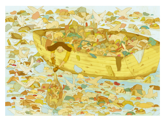
Tan Zi Xi, An Effort Most Futile, 2008.