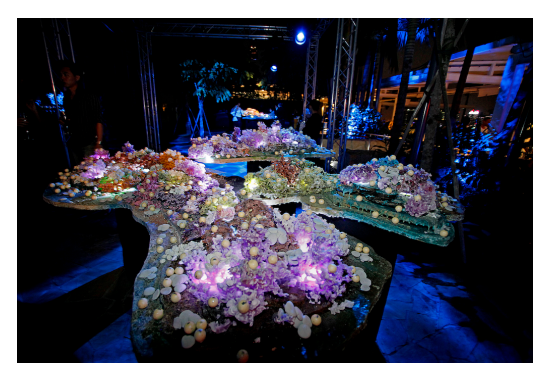
Janice Wong, Underwater Labyrinth, 2011.