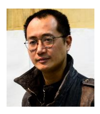
Qiu Zhijie (China)

Qiu Zhijie (b. 1969, Fujian, China) graduated from the Printmaking department at Zhejiang Academy of Fine Arts in 1992. His art is representational of a new kind of experimental communication between the Chinese literati tradition and contemporary art, social participation and the power of self-liberation of art. He is also a professor and a curator. He curated the first video art exhibition in China in 1996, and a series of "Post-sense Sensibility" exhibitions during 1999 and 2005. In 2012 he was the chief curator of the 9<sup>th</sup> Shanghai Biennale.