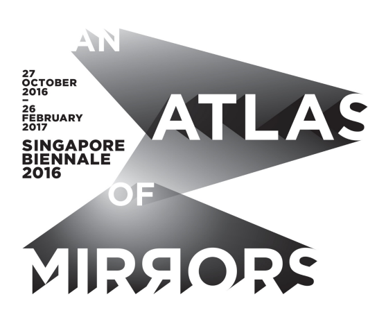
Annex A: Singapore Biennale 2016 - Artists Biographies