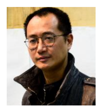
Qiu Zhijie (China)

Qiu Zhijie (b. 1969, Fujian, China) graduated from the Printmaking department at Zhejiang Academy of Fine Arts in 1992. His art is representational of a new kind of experimental communication between the Chinese literati tradition and contemporary art, social participation and the power of self-liberation of art. He is also a professor and a curator. He curated the first video art exhibition in China in 1996, and a series of "Post-sense Sensibility" exhibitions during 1999 and 2005. In 2012 he was the chief curator of the 9<sup>th</sup> Shanghai Biennale.