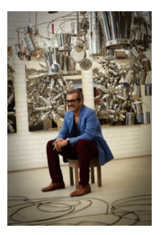
Subodh Gupta (India)

Subodh Gupta (b. 1964, Khagaul, India) studied at the College of Art, Patna before moving to New Delhi, where he currently lives and works. Trained as a painter, he has gone on to work in a variety of media including performance, video, photography, sculpture and installation. He is best known for working with everyday objects that are ubiquitous throughout India, such as mass-produced stainless steel utensils, bicycles and milk pails. From these ordinary objects, he produces works that reflect on universal issues including migration, globalisation and the cosmos. Gupta's recent solo and group exhibitions have been presented at Hauser & Wirth, Somerset (Bruton, UK, 2016), Museum of Fine Arts, Boston (2016), Victoria and Albert Museum (London, 2015), Hauser & Wirth (New York, 2015), Museum für Moderne Kunst (Frankfurt, 2014), Arario Gallery (Seoul and Shanghai, 2014), and National Gallery of Modern Art (New Delhi, 2014).