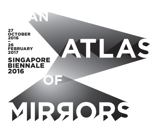
Annex B: Singapore Biennale 2016 - Artists Biographies