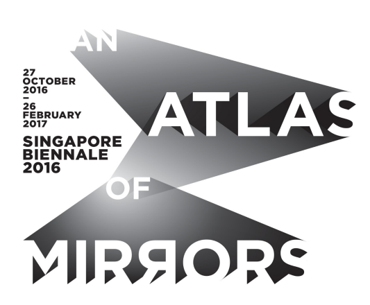
Annex C: Singapore Biennale 2016 - Biographies of Curatorial Team Members