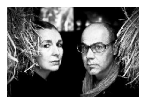
MAP Office (Hong Kong)

MAP Office is a multidisciplinary platform devised by Laurent Gutierrez (b. 1966, Casablanca, Morocco) and Valérie Portefaix (b. 1969, Saint-Étienne, France). This duo of artists/architects have been based in Hong Kong since 1996, working on physical and imaginary territories using varied means of expression including drawing, photography, video, installations, performance, and literary and theoretical texts. Their entire project forms a critique of spatio-temporal anomalies and documents how human beings subvert and appropriate space.