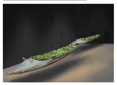
Bounpaul Phothyzan, Lie of the Land, 2017.