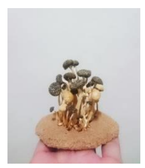
Calvin Pang, Where Am I (detail), 2017.