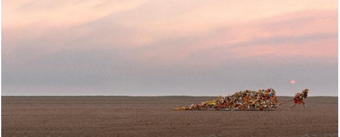
Hiromi Tango, Lizard Tail, 2016, 2017. Image courtesy of the artist and Sullivan+Strumpf.

Singapore, 12 April 2017 – The seventh edition of Singapore Art Museum's annual familyfocused contemporary art exhibition returns with Imaginarium: To the Ends of the Earth . From 6 May to 27 August 2017 at SAM at 8Q , explorers of all ages are invited to take a closer look at our surroundings and the environments we reside in through immersive, tactile and interactive artworks by nine contemporary artists.