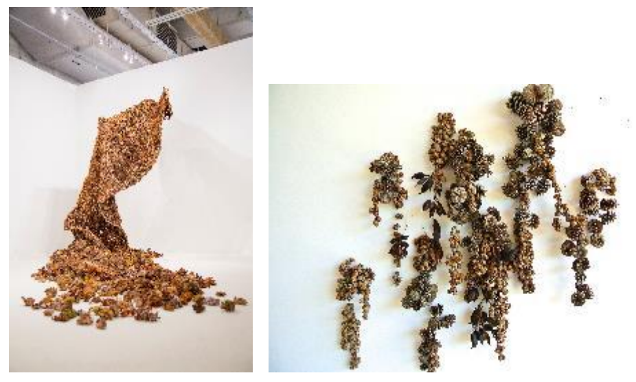
Nandita Mukand, The Origin: The Tree and Me & The Unborn, 2017.