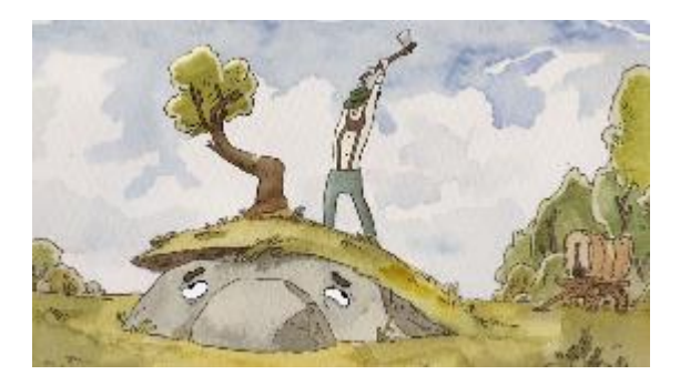
An Object at Rest, Seth Boyden (USA), 2015 5:43 min, no dialogue. Singapore Premiere Silver medal winner in Animation, 42nd Student Academy Awards Finalist, BAFTA US Student Film Awards 2016

As part of Imaginarium: To the Ends of the Earth , visitors may enjoy a selection of local and international short films inspired by the vastness of distant lands, at the SAM at 8Q Moving Image Gallery.