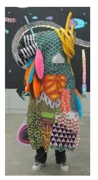
Eko Nugroho, My Wonderful Dream (detail), 2017. Image courtesy of the artist.