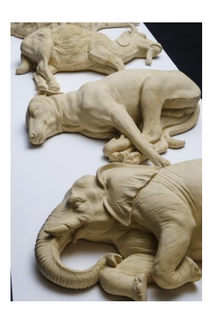
The Infinite Episode 2016 Dental plaster sculptures (set of 20) and low plinth Various dimensions Collection of the artist Nominated by Gitanjali Dang

Twenty different species of fauna, depicted in a state of dreaming sleep, make up Jitish Kallat's The Infinite Episode . Cast from dental plaster, the sculpted animals are wide-ranging, including a giraffe, swan, rhinoceros, elephant, kangaroo, ostrich, penguin and camel, among others. The artist asks: "In The Infinite Episode , the fundamental transformation that occurs in the moment of sleep is that the species surrender scale. Would a sleeping lion and a sleeping mouse share the same scale of body in the state of repose?" In other words, what the work portrays is an animalian utopia: the creatures, despite real-life divergences, are here represented approximately equal in size. They share not simply a physical space, but a state of being – sleep – wherein corporeal scale has been made irrelevant.