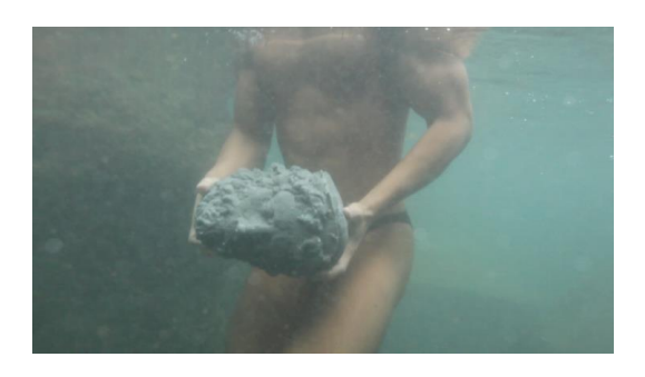
Milky Bay / 裏切りの海