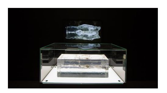
AK-47 vs. M16 2015 Ballistic gel block, bullet fragments and video (1 of a set of 21) 18.1 × 42.9 × 18.4 cm (gel block); video duration 2:48 mins Collection of Singapore Art Museum Nominated by Arlette Quynh-Anh Tran

AK-47 vs. M16 was inspired by a historical incident that almost never was: the collision and fusion of two bullets on an American Civil War battlefield, a phenomenon that statisticians concluded has the possibility of only one in a billion. Working with ballistics experts through a long process of trial and error, The Propeller Group has recreated this phenomenon, capturing the explosive, exquisite impact at the instant when both projectiles meet. Two bullets – one from an AK-47, which was invented by the Soviets, and the other from an M16, the brainchild of the U.S. army – were fired through a block of ballistic gelatin, a material that closely approximates the density of human flesh, and is primarily used as a medium to test the effects of firearms.