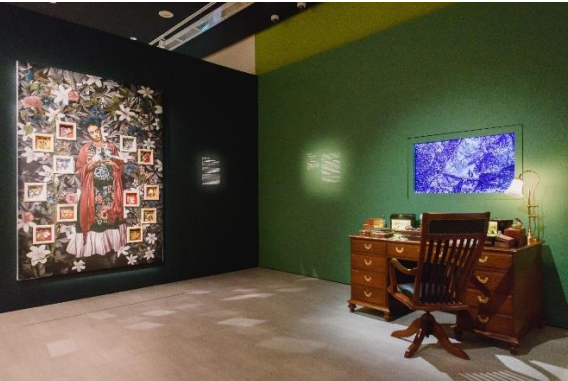
Left to right: Medium at Large exhibition (2014); After Utopia exhibition (2015)

18 June 2018, Singapore – SAM opens a presentation titled Installation in Progress today, which explores ideas of exhibitions and exhibition-making through the lens of SAM's own history. Using the development of the institution – from when it first opened its doors in 1996 as Singapore's first fully dedicated art museum, to its transformation over the years in the Singapore art scene – Installation in Progress looks at why and how exhibitions are created. Installation in Progress is sited at SAM Curve at the Singapore Art Museum from 18 June to 26 August 2018.