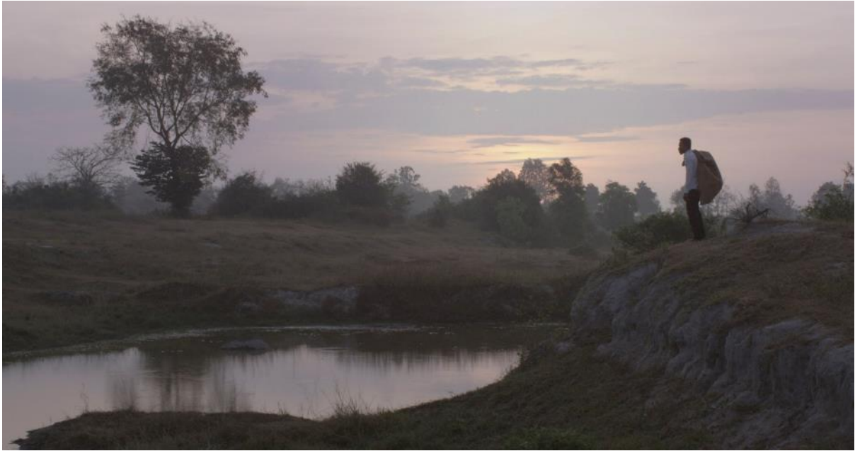
Funeral