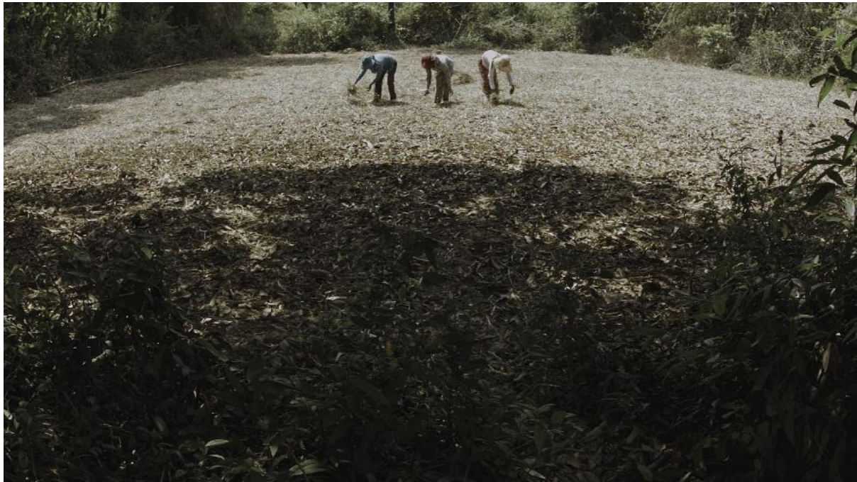
MONOLOGUE - Image courtesy of Vandy Rattana