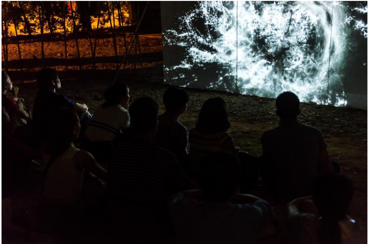
Zai Tang - Escape Velocity II, Image courtesy of Tuckys Photography