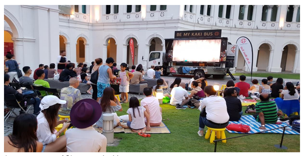
Outdoor Movie Screening: It's a Great, Great World Fri, 25 Jan | SAM at 8Q, Plaza | 8PM – 9.30PM | Free