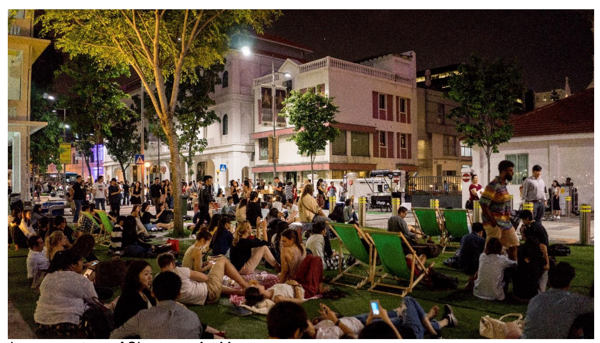
Outdoor Movie Screening: The Greatest Showman Sat, 19 Jan 2019 | 8PM – 10PM SAM at 8Q, Plaza | Free