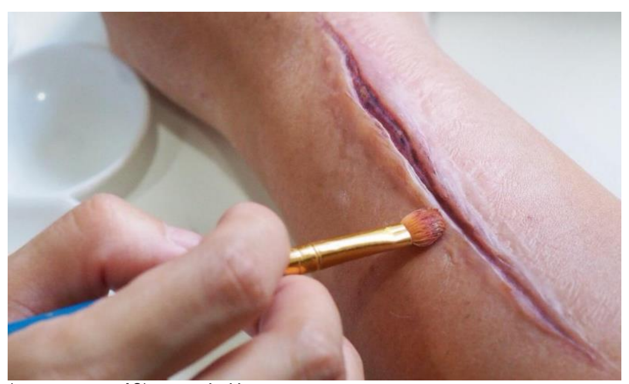
Special Effects Makeup Workshop Fridays, 18 & 25 Jan 2019 | 7PM - 8.30PM Workshop Space 1 & 2, L2, SAM at 8Q | Ticketed