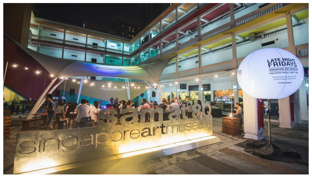
Image courtesy of Singapore Art Museum SAM Late Nights Friday, 18 Jan 2019 | 7PM - 10PM SAM at 8Q, Plaza | Free

Images are available for download here. Image credits are as per file name.