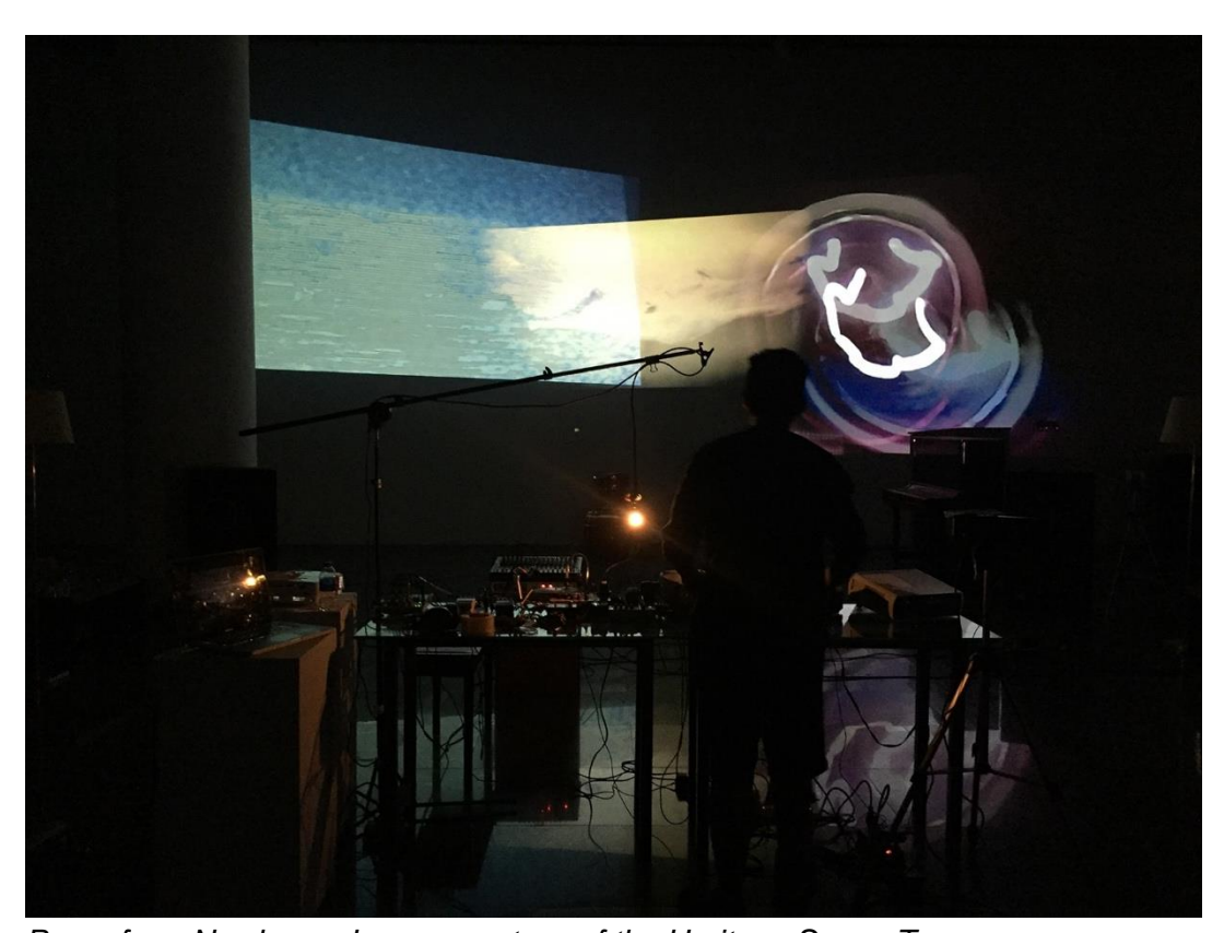
Poem from Nowhere

Sat, 26 Jan | SAM at 8Q, Level 2 Moving Image Gallery | 6PM | Free with registration