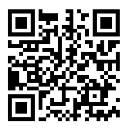
Scan the QR code to access the video

lockdown. Terminal 2, which is currently being renovated, parallels the ongoing refresh of SAM behind this hoarding, and members of the public are invited to take a virtual walk through Terminal 2 with the artist by scanning the original QR code, featured alongside the artwork caption on the hoarding.