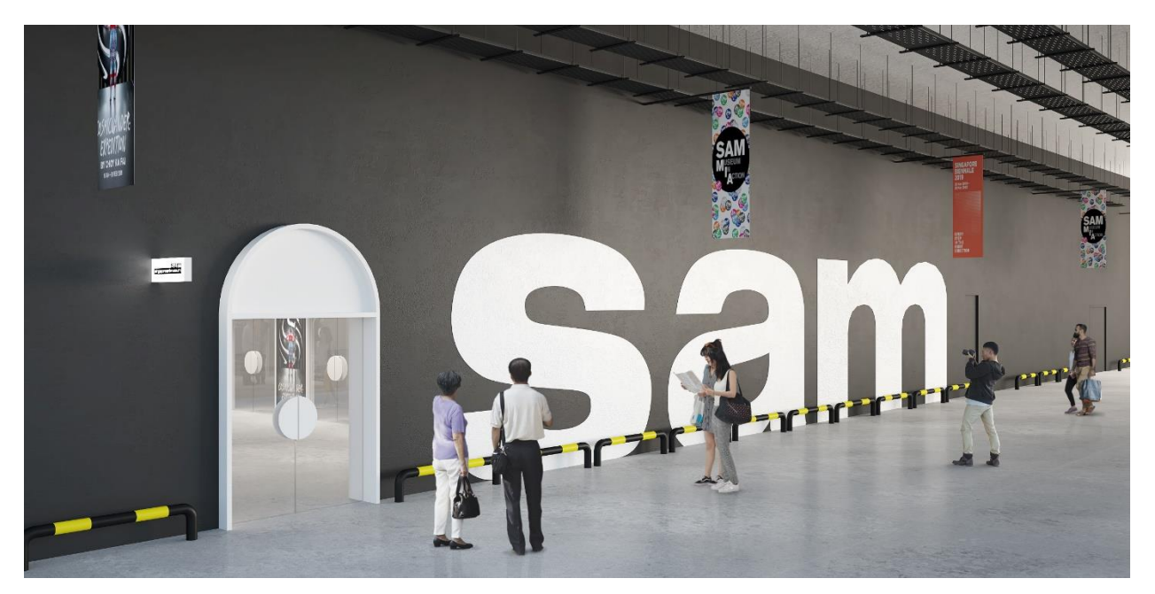
Artist impression of the entrance of SAM at Tanjong Pagar Distripark, the museum's new contemporary art space opening in early 2022

SAM intends to expand museum art experiences into neighbourhoods across Singapore, and will open a new contemporary art space at Tanjong Pagar Distripark by early 2022