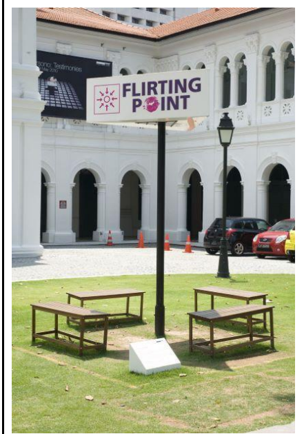
vertical submarine, 'Flirting Point', 2009; image courtesy of Singapore Art Museum