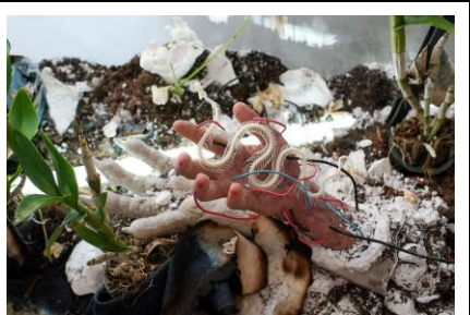
Korakrit Arunanondchai, 'Painting with history in a room filled with people with funny names 3', 2015–16. Installation view (detail).

Drawing on old and new lexicons, The Observatory seeks to bridge artists and expressions. Two decades on, the band's polymath practice encompasses music and performance; in-person festivals and online radio shows; touring gigs and interdisciplinary exhibitions.