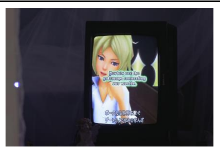
Johann Yamin, 'eSports, Angels and Other Tomodachi', 2020-21