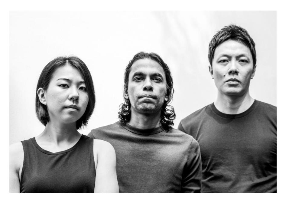
The Observatory

SAM's new space on Level 1 in Tanjong Pagar Distripark features two climate-controlled galleries that will host large-scale exhibitions by Singapore-based band The Observatory, and Thai-born and US-based artist Korakrit Arunanondchai respectively.