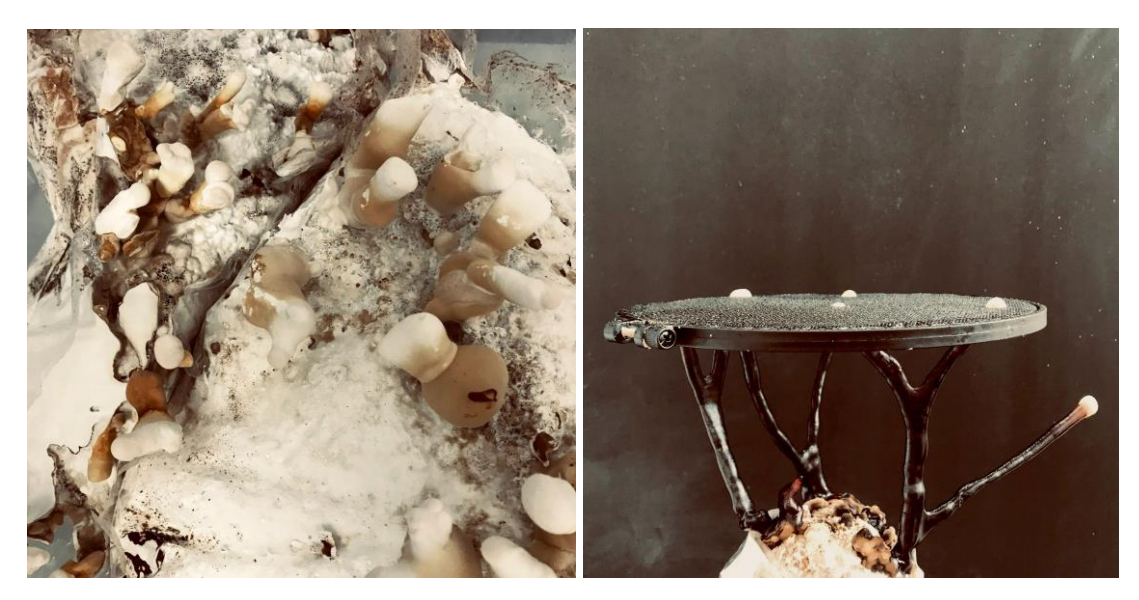
The Observatory, 'REFUSE', 2021.

The space will open with multiple art presentations by Southeast Asian artists, programmes for the public, and a coffee bookshop by Epigram Bookshop and Balestier Market Collective.