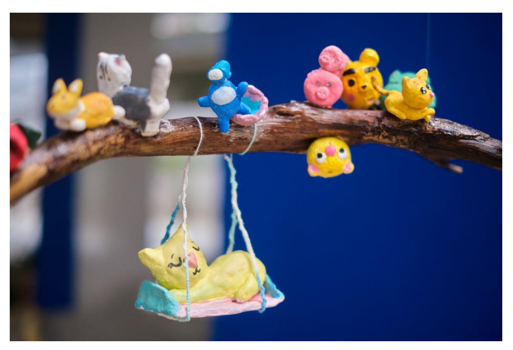
CHIJ Our Lady Queen of Peace, Childhood, 2020

Featuring both physical and digital programmes, SAM reimagines meaningful ways of connecting with their young audiences this school holiday.