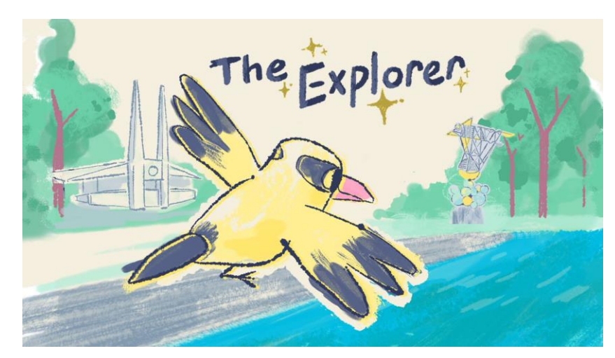
Annuendo, Illustration of The Explorer comic, 2021

Central to the project is the launch of a new intergalactic comic by SAM, The Explorer , on 20 November 2021. To encourage a more holistic educational approach incorporating Science, Technology, Engineering, the Arts and Mathematics (STEAM), accompanying programmes for children and families include online talks and workshops conducted over Zoom on illustration, interactive storytelling as well as sculpture making.