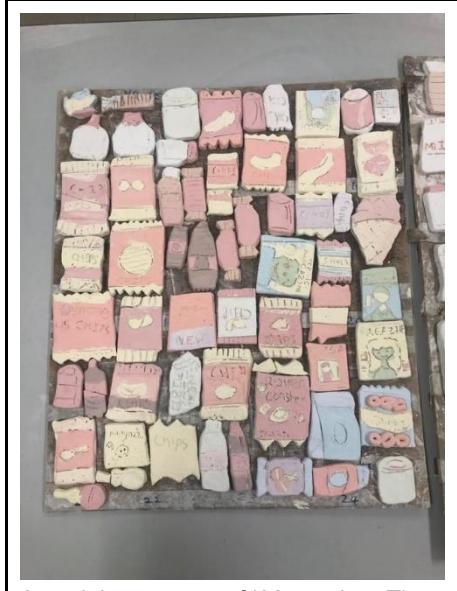
A work in progress of 'Mamashop Then and Now', 2022, by Primary 4 students of St Anthony's Primary School.

What will our Mamashops look like in the future?