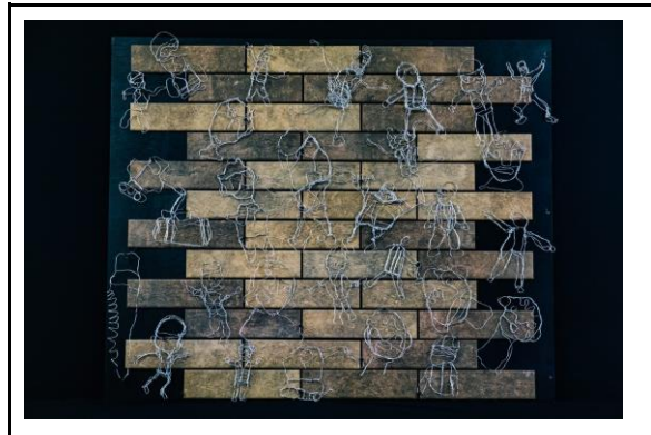
Mayflower Primary School, Primary 4 students, 'MFPS Idols – The Construction Workers', 2021. 3D Sculpture, Aluminium wire, dimensions variable.

Made in response to Singapore Idols by artist Jing Quek, MFPS Idols – The Construction Workers sheds light on oft-forgotten groups of people who have contributed to Singapore. Our artwork is a tribute to the construction workers, the unsung heroes who are rebuilding and renovating our original MFPS campus.