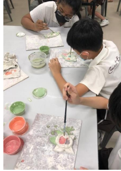
Primary 4 students from St Anthony's Primary School working on ' Branching Love ', 2022.