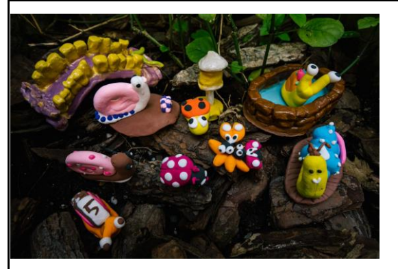
CHIJ Our Lady Queen of Peace, Primary 4 students, 'Secret Garden', 2021. Ceramics and clay, dimensions variable.

Though the wire sculpting experience was not easy, it is incomparable to what the construction workers face every day. The making of this artwork helped us gain a new sense of respect for the construction workers who are seldom remembered for the buildings they help to build.