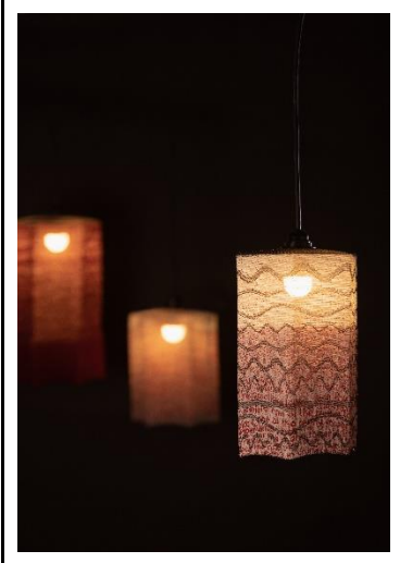
Berny Tan, 'a shapeless mass; a network of times', 2022, work in progress.