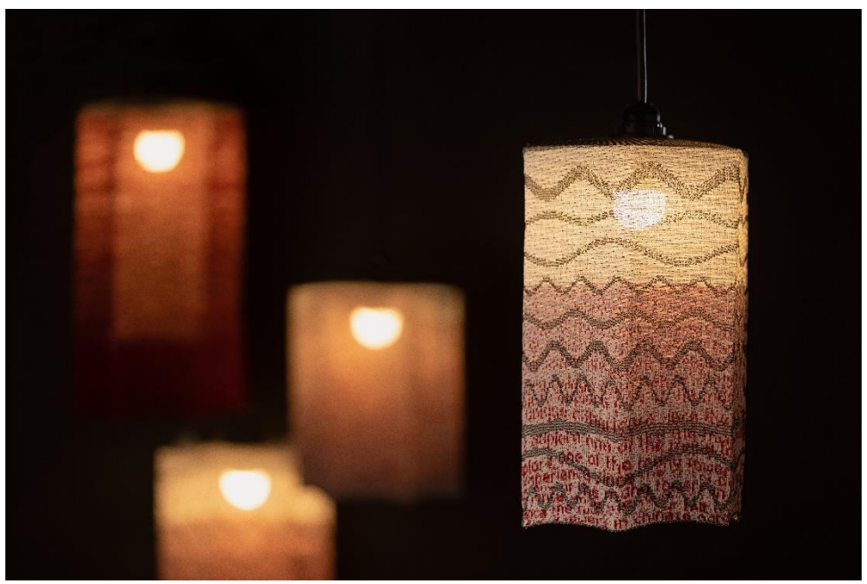
Berny Tan, a shapeless mass; a network of times (2022), work in progress.

The second edition of Art in the Commons: Data Visualising Jurong returns with a new art installation by Singaporean artist Berny Tan, exploring another area of the Jurong district – Chinese Garden, located in Jurong Lake Gardens. Closed for redevelopment since 2019, the Chinese Garden can only be experienced in fragments today: viewed only from a distance, in photographs, and in memories.