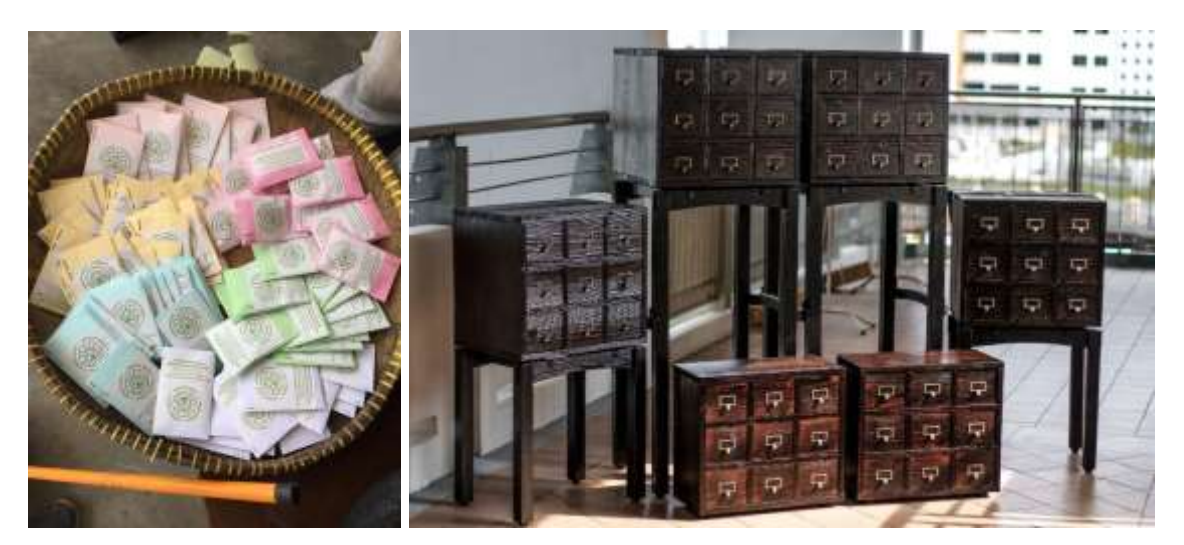
Left: Chu Hao Pei, documentation photographs of the artist's experiences in Yogyakarta with seed advocacy; image courtesy of the artist. Right: Chu Hao Pei, work-in-progress image of Seeding Sovereignty , 2022. Image courtesy of Marcuse Woodworks.

1 March to 11 September 2022 at Bedok, Ang Mo Kio, Jurong, Tampines public libraries