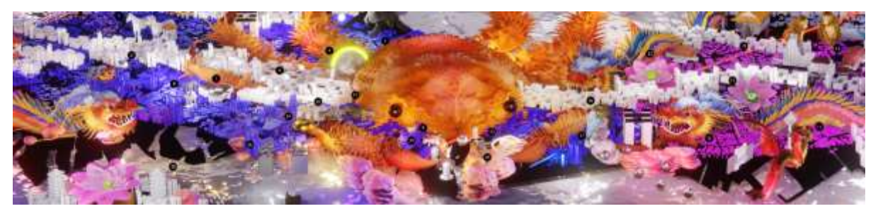
Zheng Mahler, The Green Crab: A Diagram of Auspicious Spatial Organization , 2022

Till 28 August 2022 at SAM's Bras Basah and Queen Street hoardings