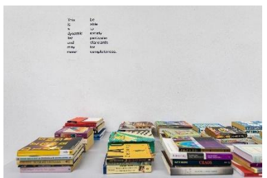
Installation view of Heman Chong's The Library of Unread Books (2016-ongoing), as part of Singapore Biennale 2022 named Natasha.

Venue(s): International Plaza Singapore #01-22