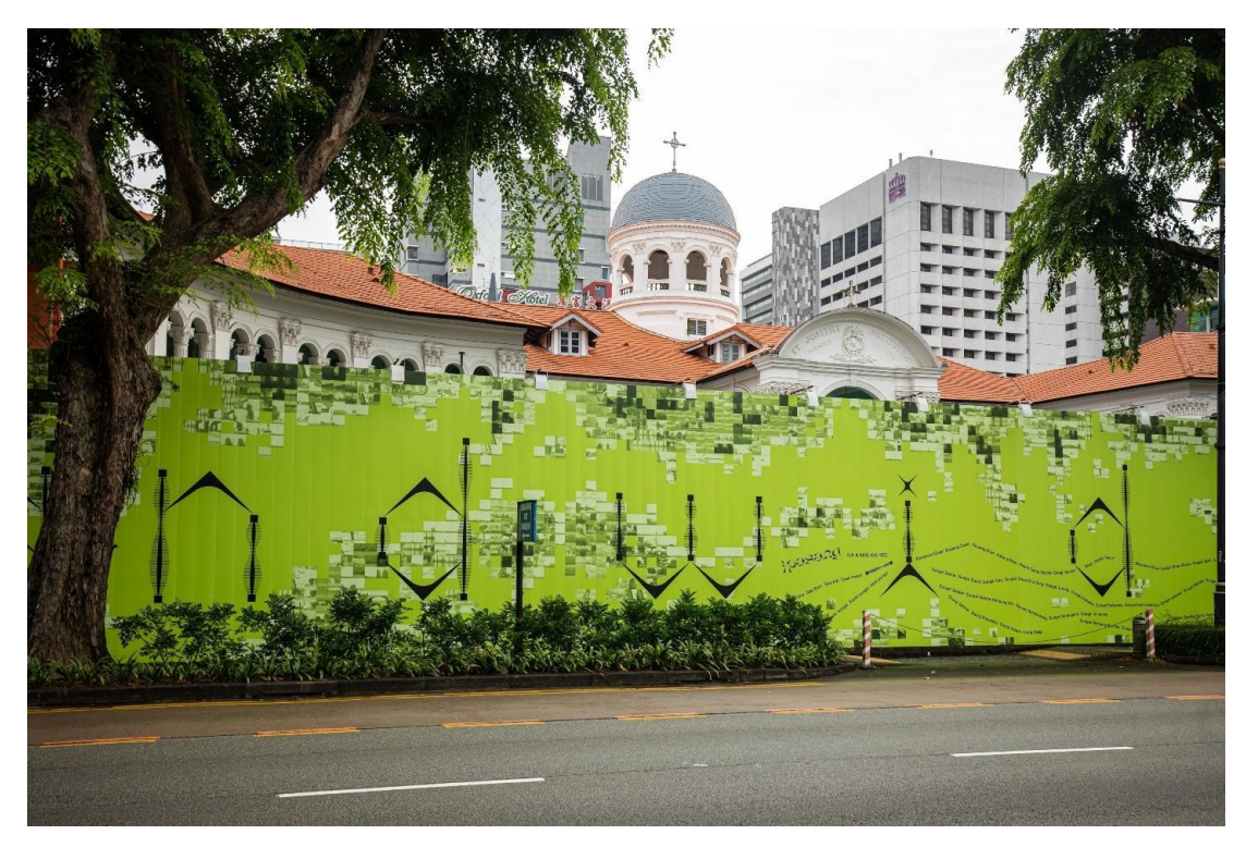
Installation view of AWKNDAFFR's Islandwide Coverage (2022) , as part of Singapore Biennale 2022 named Natasha.

Venturing to SAM Hoardings, AWKNDAFFR's Islandwide Coverage will be featured at the Hoardings along Bras Basah Road. Designed by CROP, the work uses a combination of symbols and shapes to represent networks and connectivity. An overview of artworks across Singapore can be found in Annex B .