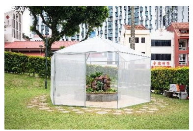
Installation view of Trevor Yeung's The Pavillion of Regret (2022), as part of Singapore Biennale 2022 named Natasha.