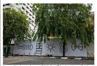
Installation view of Yejin Cho's draw2play (2022), as part of Singapore Biennale 2022 named Natasha.