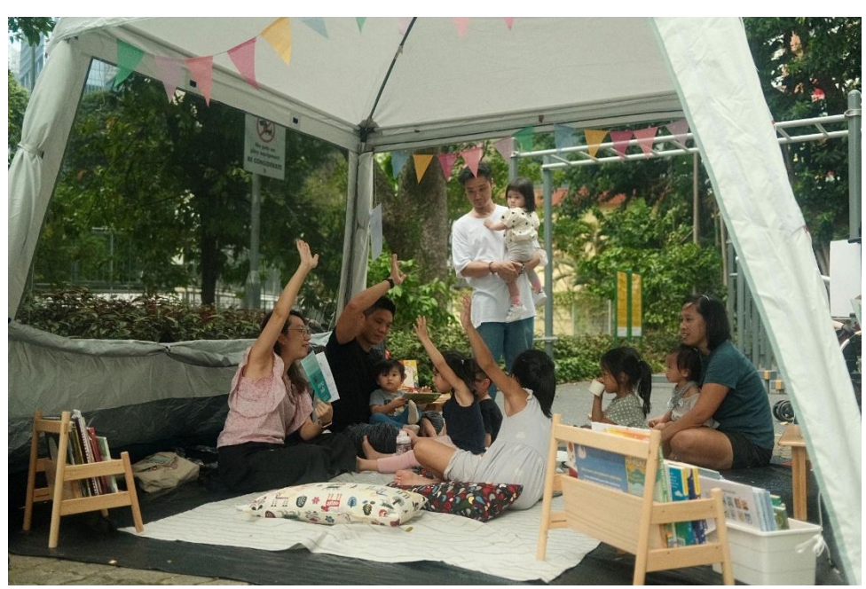
Visitors partaking in Natventure's 'A Roving Pop-up Children's Bookstore' programme, as part of SAM's public art initiative, The Everyday Museum.

From 27 May to 4 June 2023, 12pm-5pm, Various locations such as Duxton Plain Park, Everton Park and Wessex Estate Free