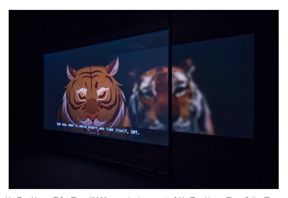
Ho Tzu Nyen, T for Time (2023–ongoing), as part of Ho Tzu Nyen: Time & the Tiger.

Tracing over two decades of artistry, the solo exhibition is the first mid-career survey of Ho's prolific artistic practice.