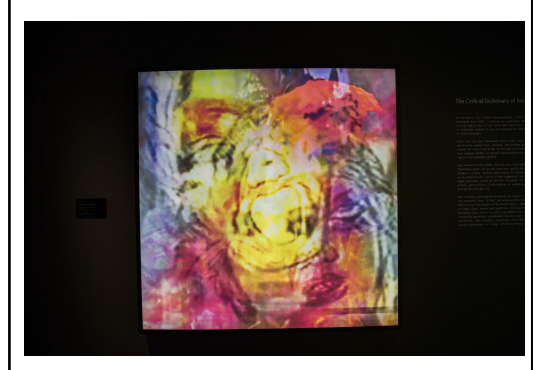
Ho Tzu Nyen, 'CDOSEA: Square Stacks (Faces)', 2019.

Each of these lightboxes comprises 26 images overlaid on top of one another through the technique of lenticular prints. At first glance, these images appear to be flattened onto a single surface. However, as the audience move past the lightboxes, the seemingly static images unfold and themselves as a moving image, representing their respective themes. As physical condensations of Ho Tzu Nyen's video and database The Critical Dictionary of Southeast Asia (CDOSEA), these lenticular lightboxes continue the artist's central inquiry: what is Southeast Asia—a region that was never unified by language, religion or political power? But rather than seek an answer within the academic discipline of area studies. Ho shifts the question into the realm of formal aesthetics, to consider the region as an open composition and conceptually plastic work of art.