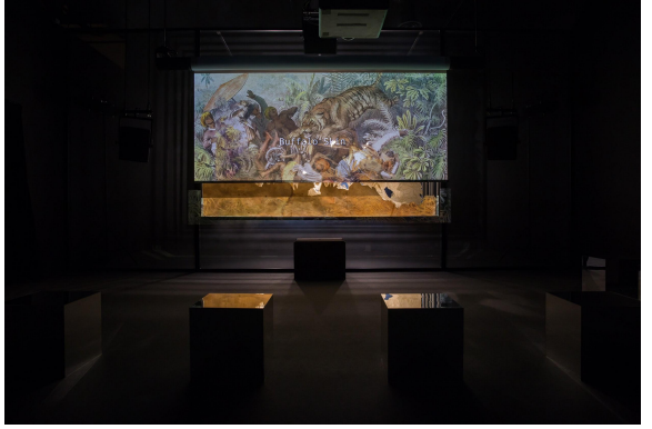
Ho Tzu Nyen, One or Several Tigers (2017), as part of Ho Tzu Nyen: Time & the Tiger.