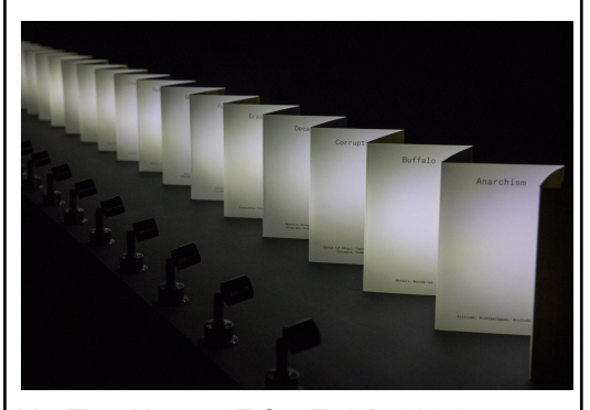
Ho Tzu Nyen, 'F for Fold', 2021.

F for Fold (2021) is an abridged dictionary of 26 terms drawn from Ho Tzu Nyen's meta-project The Critical Dictionary of Southeast Asia (2012–). Designed as an accordion book, the work unfolds into various sculptural forms, reflecting Ho's aesthetic inquiry into Southeast Asia as an open form. While its title is a direct reference to the accordion folds of the book, it is also a term in itself within the database of Ho's The Critical Dictionary of Southeast Asia. In thinking about folds, the artist is drawn particularly to the topological thinking of philosopher Michel Serres, where two seemingly unconnected things might be "folded" together to reveal new connections. Folding and unfolding the book thus allows the artist not only the chance to present new sculptural permutations. but also to allow seemingly unconnected terms to touch one another and to produce new connections-not unlike the power of editing, as seen in the randomised sequencing of the video work CDOSEA (2017).