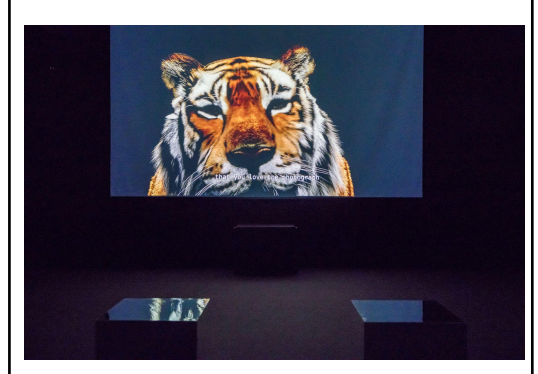
Ho Tzu Nyen, 'One or Several Tigers', 2017.

One or Several Tigers (2017) is a video installation that traces the figure of the tiger as it appears across the different histories and mythologies of Southeast Asia: from the tiger that allegedly interrupted Government-Superintendent G. D. Coleman's road survey in the jungles of Singapore to the weretigers in the Malay world who inhabit the space between human and animal, between the present and the past. This work centres on a strange hypnotic duet between G. D. Coleman and a tiger. At points, it becomes unclear just who is singing which line, as the identities of the two seem to merge. This ambiguity and transformation represents, for Ho, the possibility of our becoming something else, outside of ourselves. Tigers, and weretigers, represent at once Southeast Asia's cosmologies and ways of knowing, but also they are shapeshifters who populate Ho Tzu Nyen's body of work.