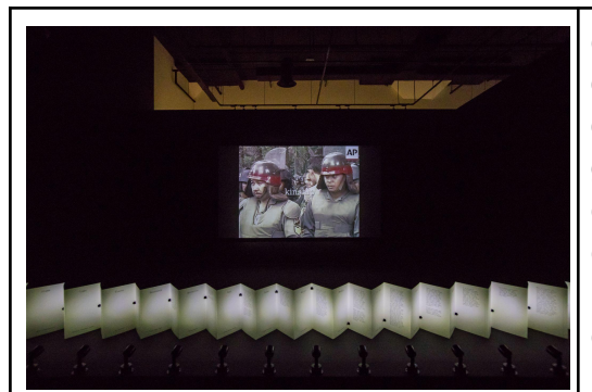
Ho Tzu Nyen, ' CDOSEA ', 2017.

exhibition features CDOSEA also takes the form of a video installation, with a projection screen outfitted with LED lights that are programmed to glitch the work's appearance. This dynamic and ever-changing nature of the work reflects the climatic conditions of Southeast Asia as a region marked by geopolitical turbulence and tropical entropy.