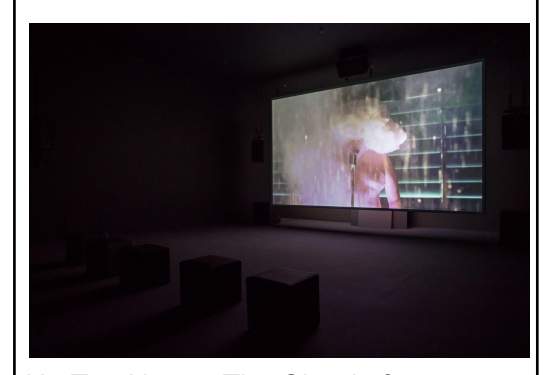
Ho Tzu Nyen, 'The Cloud of Unknowing', 2011.

The Cloud of Unknowing references the title of a 14th-century medieval Christian treatise on contemplative faith, in which the "cloud of unknowing" is used to describe the encounter with an abstract and transcendent divine. Shot entirely within a public housing block in Singapore days before its scheduled demolition, the video features a cast of eight characters set across different apartments. The individuals live hermetically in their apartment space until the appearance of a permeating and mysterious cloud connect their seemingly disjointed lives.