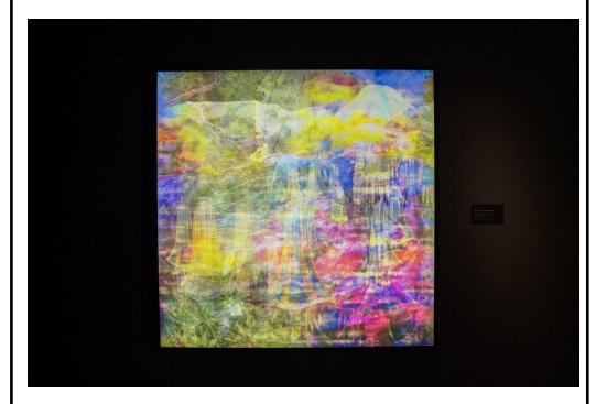
Ho Tzu Nyen, 'CDOSEA: Square Stacks (Landscapes)', 2019.