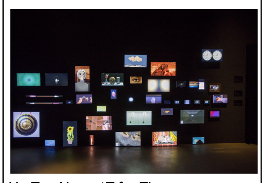
Ho Tzu Nyen, ' T for Time: Timepieces', 2023–ongoing.

Commissioned by Singapore Art Museum and Art Sonje Centre with M+, in collaboration with Museum of Contemporary Art Tokyo and Sharjah Art Foundation