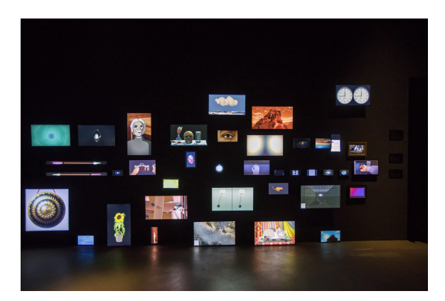
Ho Tzu Nyen, T for Time: Timepieces (2023 – ongoing), as part of Ho Tzu Nyen: Time & the Tiger.

The work is co-commissioned with the exhibition's co-organisers ASJC, and in collaboration with international partners including M+, Museum of Contemporary Art Tokyo, and Sharjah Art Foundation. This partnership across institutions for the new commission is emblematic of SAM's effort to broaden and globalise the production and curatorial support given to contemporary artists from Singapore and the region.