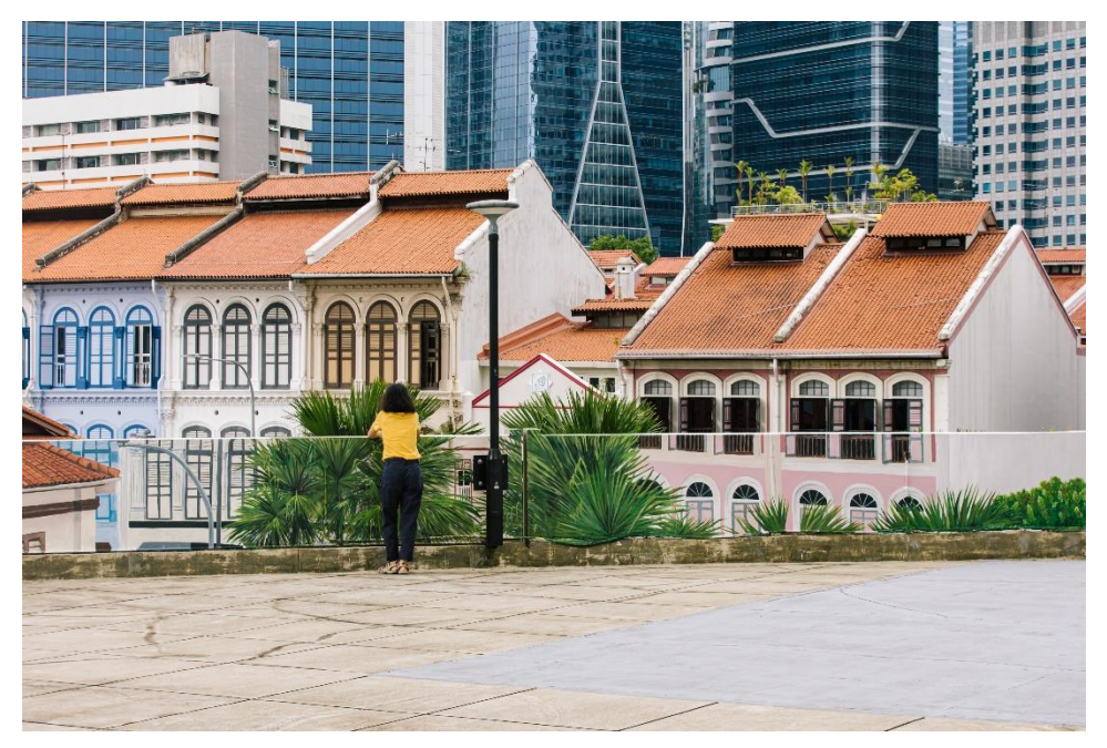
Isabella Teng, Installation view of Little Islands (2023).

Beginning with SAM's immediate neighbourhood, the first of the two public art trails will explore Tanjong Pagar district, an area that has seen dramatic transformation over the decades to become one of the largest seaports in the world. Featuring artistic responses by six contemporary practitioners, Port/raits of Tanjong Pagar explores the multifaceted histories, identities, development and economic aspirations of the Tanjong Pagar district. The site-specific installations delve into intersecting interests of urban planning, materiality, boundaries, the non-human, and kinship as observed around each site. Port/raits of Tanjong Pagar is made possible in venue partnerships with Mapletree Investment Pte Ltd, National Parks Board, and Tanjong Pagar Town Council.