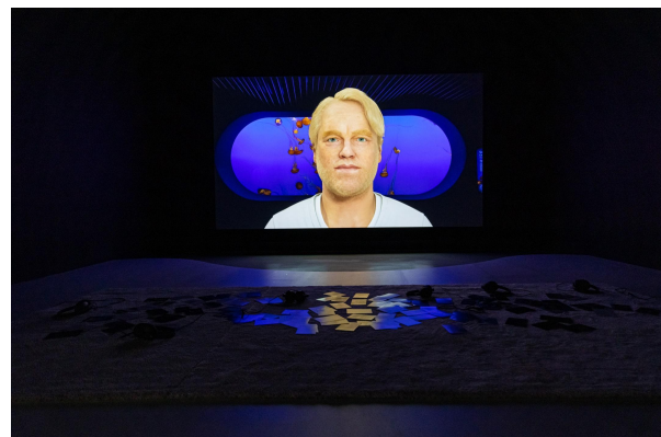
Cécile B. Evans, Hyperlinks or It Didn't Happen, 2014.

Bringing together local and international artists to explore the unstable relationships between identity, agency, and authenticity in our age of boundless digital consumption and hyper-mediation, Proof of Personhood investigates the nature of personhood and contemporary life in the 21<sup>st</sup> century. Taking advanced technology as both subject and medium, the works in the exhibition engage with interactive software, AI-synthesized images, and biometric and genomic data to contemplate and critique technologies deeply ingrained in everyday life, such as one's online presence, artificial intelligence, and data capture.