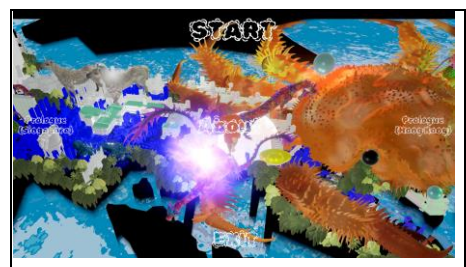
Zheng Mahler, The Green Crab: A Virtual Diagram of Auspicious Spatial Organization, 2022. Interactive computer game.