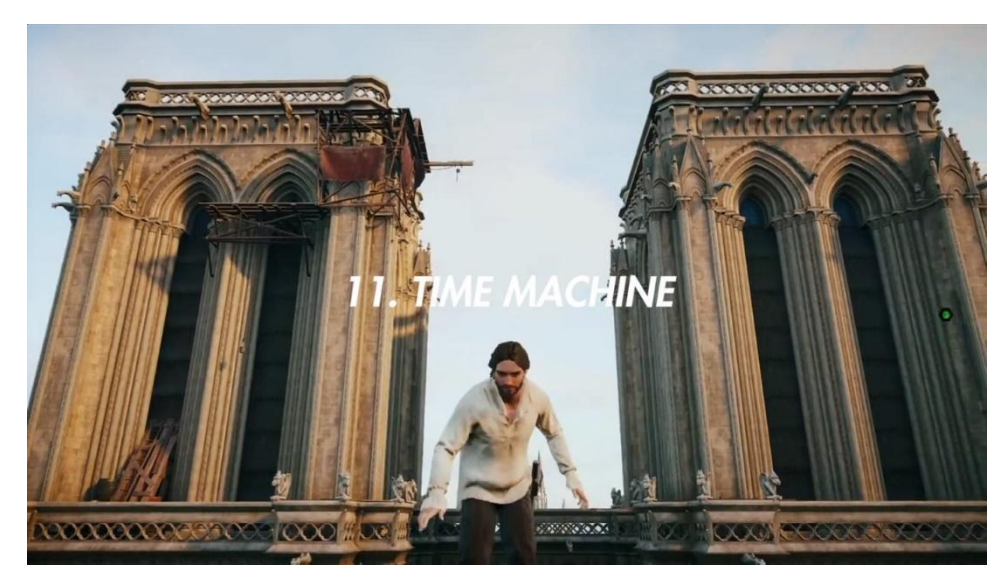
Lawrence Lek, Pyramid Schemes, 2018.