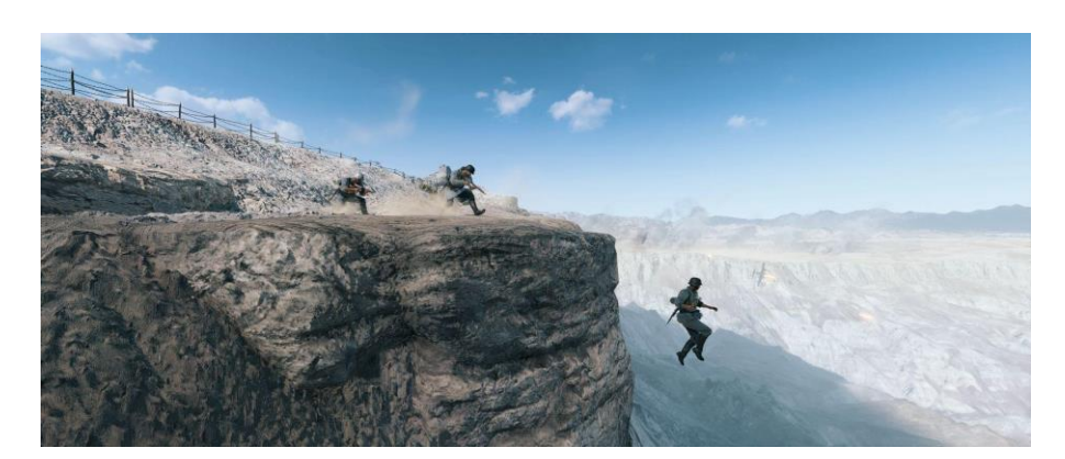
Total Refusal, How to Disappear, 2020.

Auto 's modding communities, revealing loopholes within the seemingly limitless world of modding in an introspective critique on police brutality across virtual and physical realms.