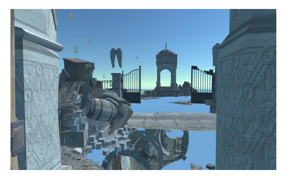
Cat Bluemke, Gameworkers & Guildworkers, 2020.