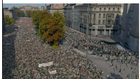
Clemens von Wederneyer, 70.001, 2019. Single-channel video (colour, sound), 16 min.

a manic reflection of a world over-saturated with information. The music video is assembled from found-footage by Yeyoon Avis Ann, and features architectural models, scenes of classic video games and documentation of protests in South Korea, Hong Kong and the United States. The exaggerated animated violence of video games obscures the everyday violence exercised by the state, reflecting the urgent tempo of Chua's soundscape. This melee contrasts with the pristine architectural renderings used to promote corporate real estate projects populated exclusively by passive subjects, suggesting another kind of violence.