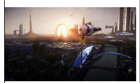
Lawrence Lek, Pyramid Schemes, 2018. Single-channel video (colour, sound), 17 min. Image courtesy the artist and Sadie Coles HQ, London.

Pyramid Schemes is a treatise on architecture in eleven chapters. Narrated by a computer-simulated voice, the video takes Victor Hugo's novel The Hunchback of Notre Dame (1831) as its historical point of departure. By fusing scenes from the video game Assassin's Creed with other simulated environments, Lek offers a sweeping journey through the evolution of architecture and spaces that reflect and inscribe power structures. The first-person perspective of a role-playing game asserts the agency of the video's wandering protagonist and reflects how virtual spaces reflect real-world issues of migration, access, and the privilege of being able to go to different places.