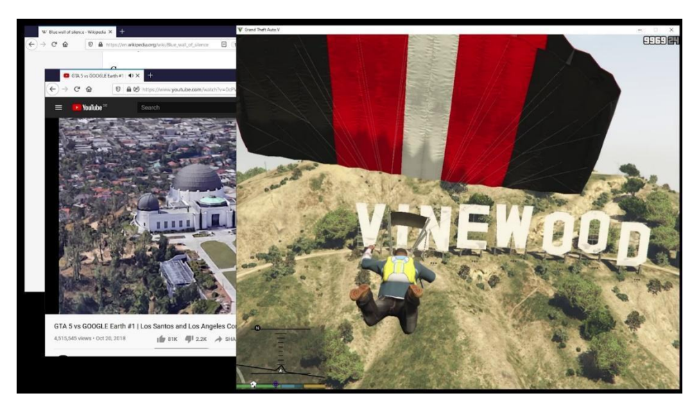
Grayson Earle, why don't the cops fight each other?, 2020. Image courtesy of the artist.

culture of Twitch streaming and Grand Theft Auto 5 modding<sup>1</sup> communities, projecting current digital concepts on the diasporic lived experiences of home and identity for Palestinian youth.