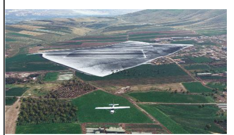
Shabtai Pinchevsky, An Abridged Draft o a Letter to Leila Khaled, 2020. Singlechannel video (colour, sound), 12 min.

An Abridged Draft for a Letter to Leila Khaled reconstructs the landscape of Palestine before the An Abridged Draft for a Letter to Nakba, as it is depicted in the Palmach Aerial Photographs Collection. Recorded in Microsoft's hyper realistic Flight Simulator program, an aerial tour of the reconstructed collection is superimposed onto satellite views of modern Israel. While the Palmach Collection was created through an aerial reconnaissance effort by the Zionist Paramilitary organisation (under the guise of civilian aerial tours) during the 1947–48 war in Palestine, today it provides rare documentation of the Palestinian landscape on the verge of its imminent erasure.