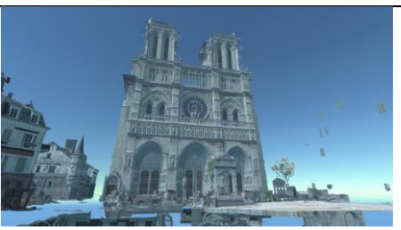
Cat Bluemke, Gameworkers and Guildworkers, 2020. Videogame essay.