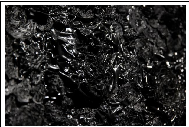
Jane Lee, Detail view of 'In Praise of Darkness', 2023.