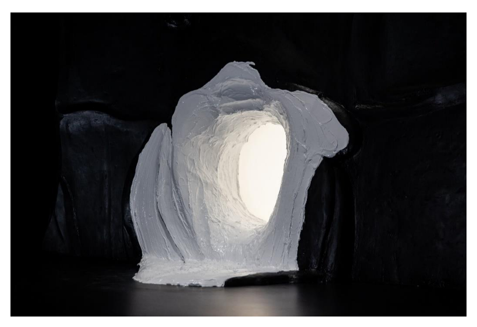
Jane Lee, Detail view of Lila (The Ultimate Play), 2023.

Featuring local and international artists whose practices push the boundaries of contemporary art, SAM's latest suite of shows will engage audiences in unexpected and unconventional ways.