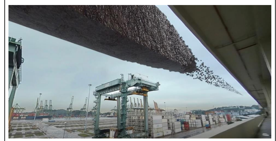
Anthony Chin, Still image of 'South Sea Ore', 2023.

South Sea Ore is an augmented reality sequence that depicts a monumental black block, built gradually from a single rock, spinning and bobbing in a disquieting way above the Tanjong Pagar port. Once completed, the block disintegrates into smaller rocks that rain down onto its surroundings and eventually turns the viewer's screen black.