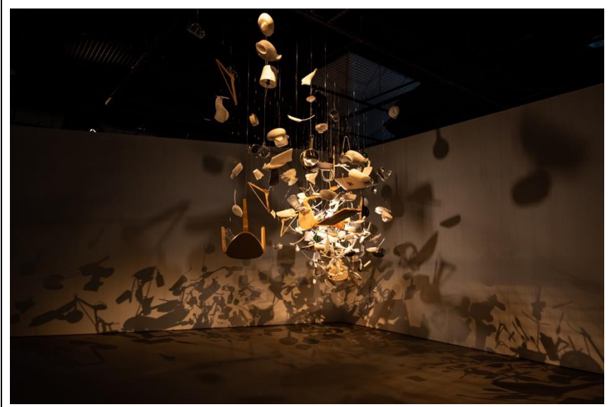
Yeyoon Avis Ann, 'A Collisional Accelerator of Everydays (A.C.A.E.)', 2023.

A Collisional Accelerator of Everydays (A.C.A.E.) is an installation that resembles particles colliding in a large accelerator, with objects such as cups, toothbrushes and chairs exploding from a central core of light. Some of these objects are stretched or compressed to demonstrate the strength of the blast. As viewers walk around the installation, they may also hear snippets of field recordings—sounds that are somewhat familiar but not entirely identifiable.