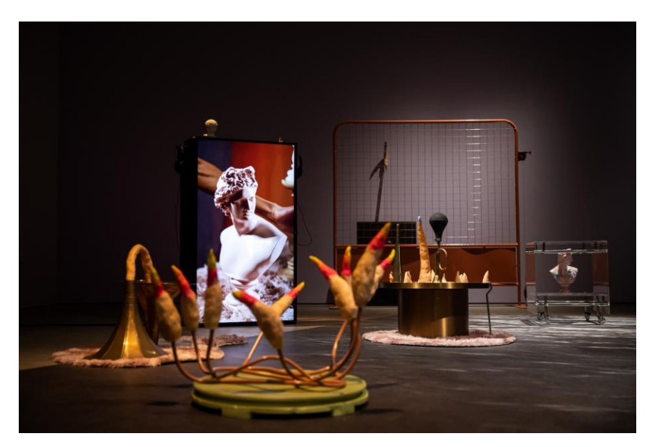
Moses Tan, Detail view of a caveat, a score, 2023.

sanctuary becomes a site for gathering and contemplation, honouring the nonhumans and indentured labourers whose oppression should not be forgotten.