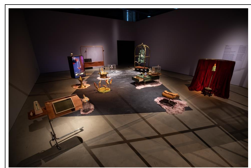
Moses Tan, 'a caveat, a score', 2023.

evoke emotional responses such as folding inwards as a protective act or opening up towards gestures of care. These movements and forms are explored by the performers in the video as well as in other components of the work, such as the vinyl graphics and polymer sculptures.