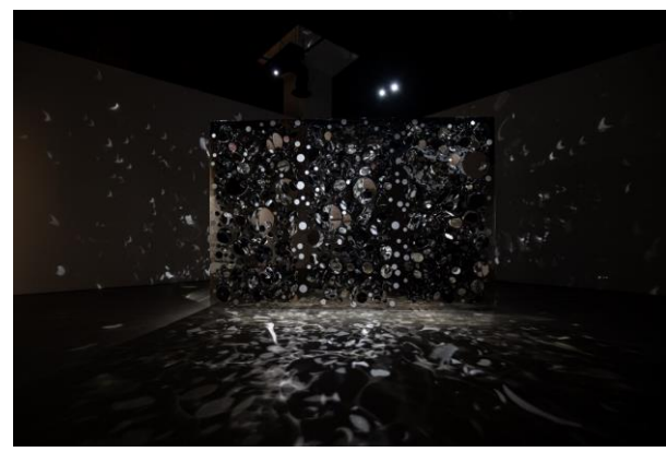
Jane Lee, 'Hollow and Empty', 2023.