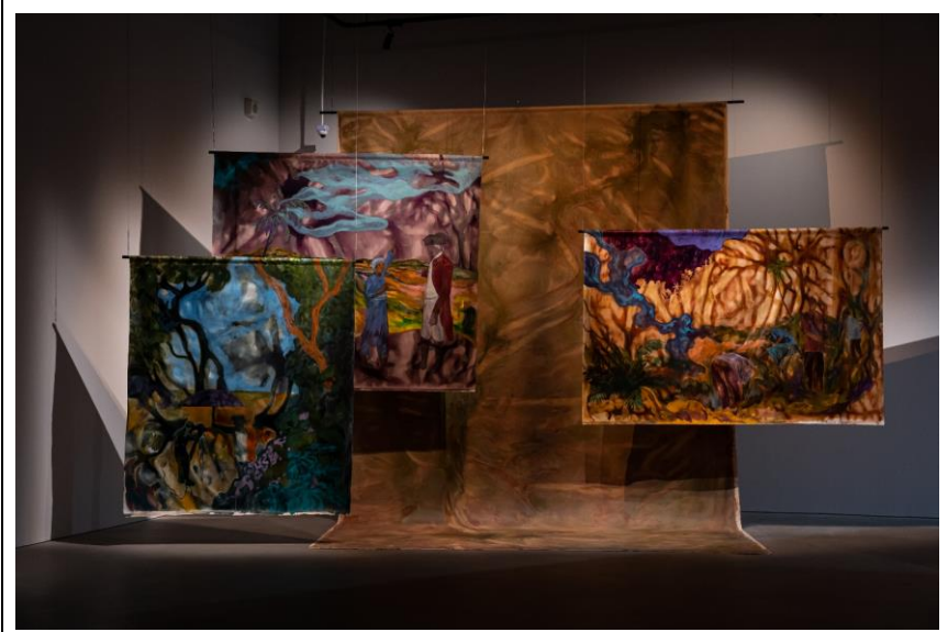
Khairulddin Wahab, 'Landscape Palimpsest', 2023.