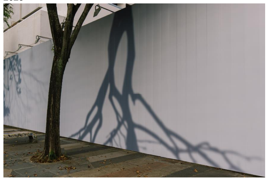
Yeyoon Avis Ann, 'Trees Upside-down', 2023.

Trees Upside-down features a simple image of tree shadows, which has been flipped, inverted and enlarged. Harmonising with the environment of Queen Street, the trees planted along the pavement cast their shadows onto the mural. Real, ever-changing shadows blend in with their inanimate graphic counterparts. As the branches and leaves of these trees shift in response to the changing lighting and weather conditions, their shadows shift in tandem, lending movement and ephemerality to the hoardings, which are often approached as a two-dimensional, static format.