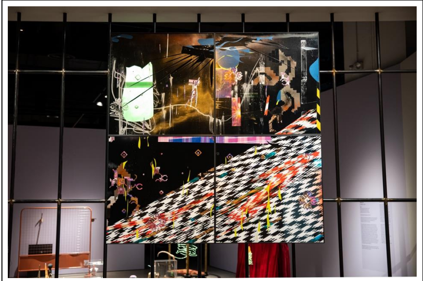
Fyerool Darma, 'Total Output featuring Aleezon, berukera, billyX, Jasim, Lee Khee San, Lé Luhur, and rawanXberdenyut', 2023.

The work's title refers to the measure of productivity in an economy, which quantifies labour output without attribution to individuals. Total Output manifests the sum of creative energies amassed in the artist's studio and foregrounds the individual, repetitive manual labour behind its production.