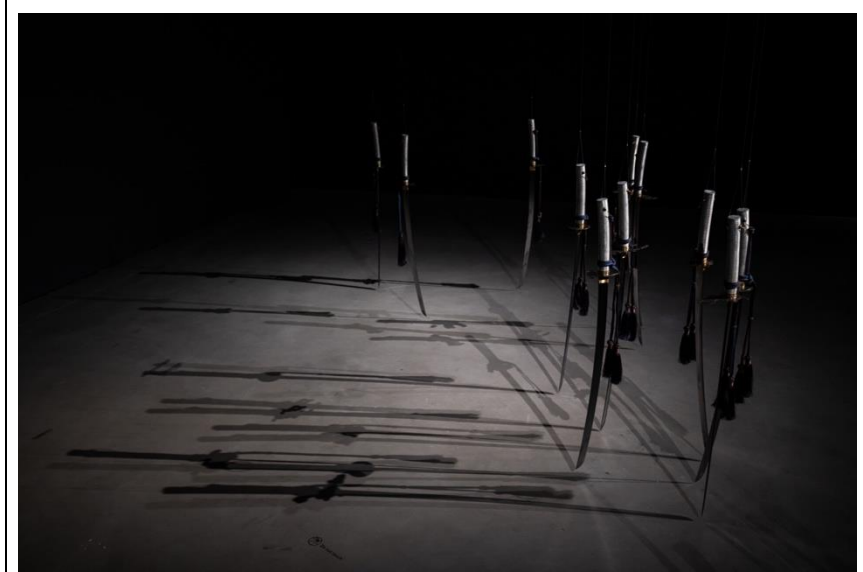
Anthony Chin, 'From Silver to Steel', 2023.

The artist also presents Trees Upside-down on the SAM Hoardings along Queen Street, on view till 29 October 2023. Avis presents graphics of tree shadows in relation to the ever-changing shadows of actual trees on the street.