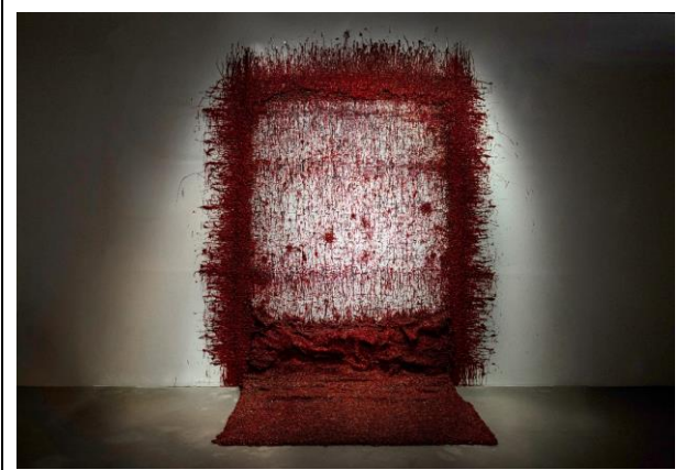
Jane Lee, 'Status', 2009.