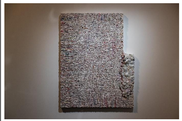
Jane Lee, 'The Object II', 2011.