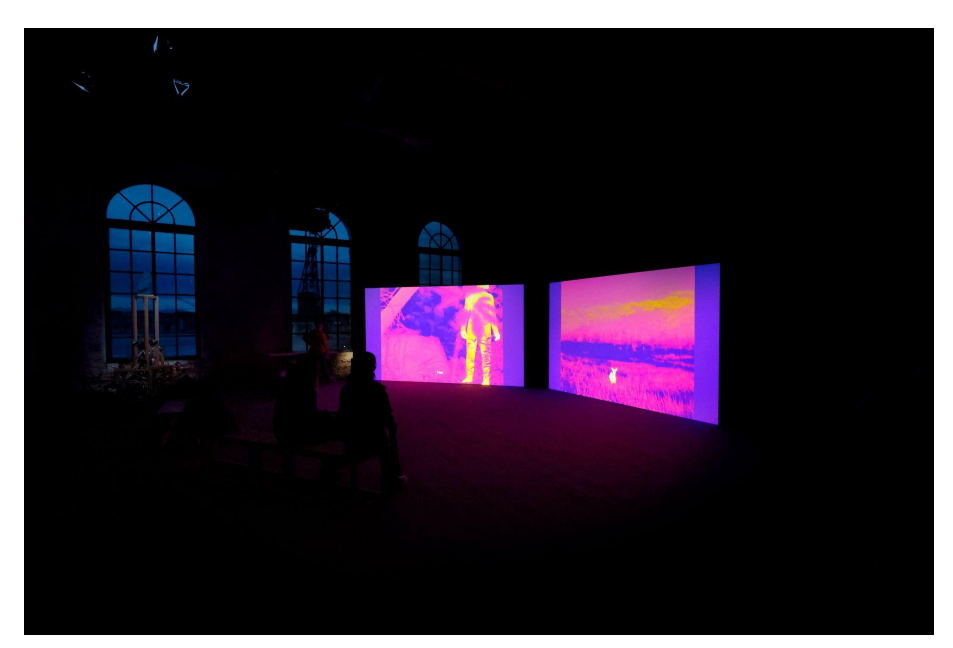
Installation view of Buffy (2024) and The Owl, The Travellers and The Cement Drain (2024).

secondary forests culminate in three key works: a two-channel video installation; a sculptural video installation; and a photographic work.