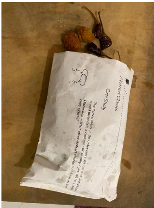
The Packet (Sri Lanka)

They currently play with explorations on the practices of Gerakan Seni Rupa Baru Indonesia (Indonesia New Art Movement, 1975-1989), Kustiyah (1935-2012), and Danarto (1940-2018); exhibition histories surrounding Kesenian Indonesia (Indonesian Art, 1955), BINAL Experimental Arts (1992), Contemporary Art Exhibition of the Non-Aligned Countries (1995); while attempting to unravel Indonesia's so-called national history through its visual representations.