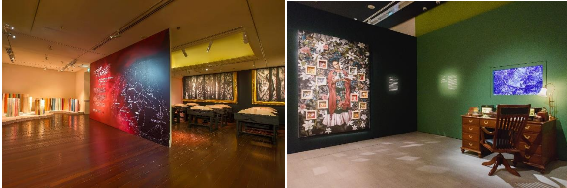
Left to right: Medium at Large exhibition (2014); After Utopia exhibition (2015)

SAM Curve presentation - Installation in Progress – explores ideas of exhibition-making